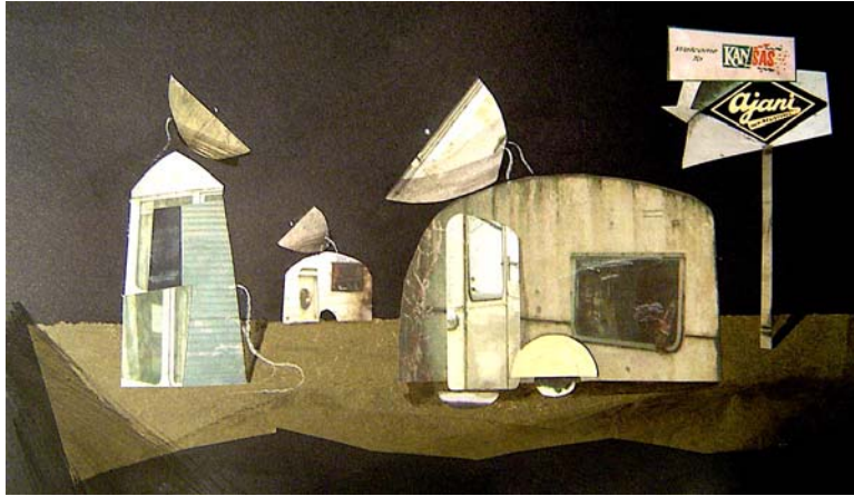
Model of Set – The Kansas Caravan Park