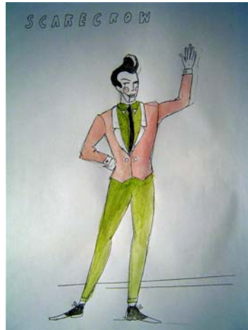
Costumes designed by Jonathon Oxlade – Designer ©