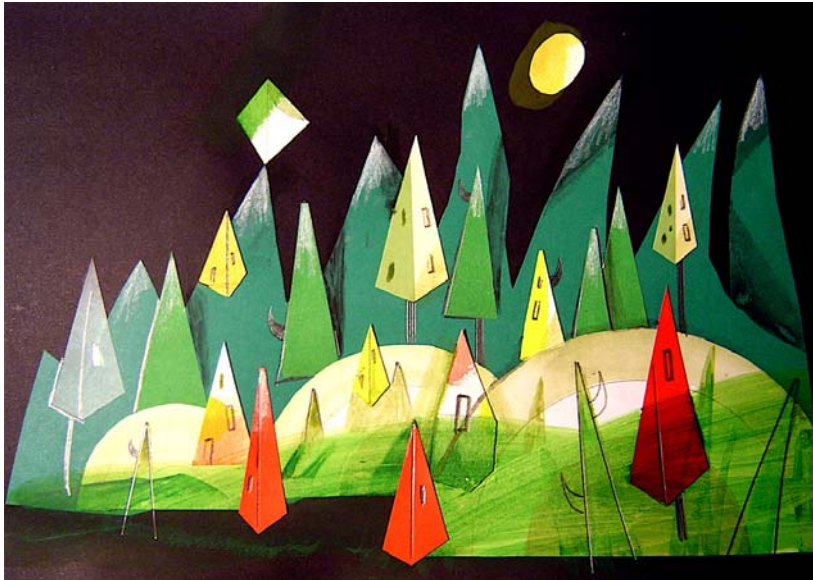
Munchkin Land - Model of Set: Jonathon Oxlade – Designer ©