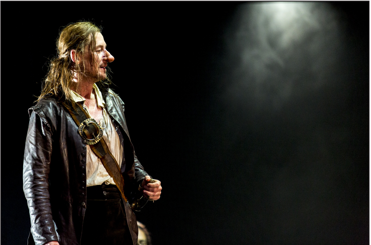
Richard Roxburgh in STC's Cyrano de Bergerac, 2014.