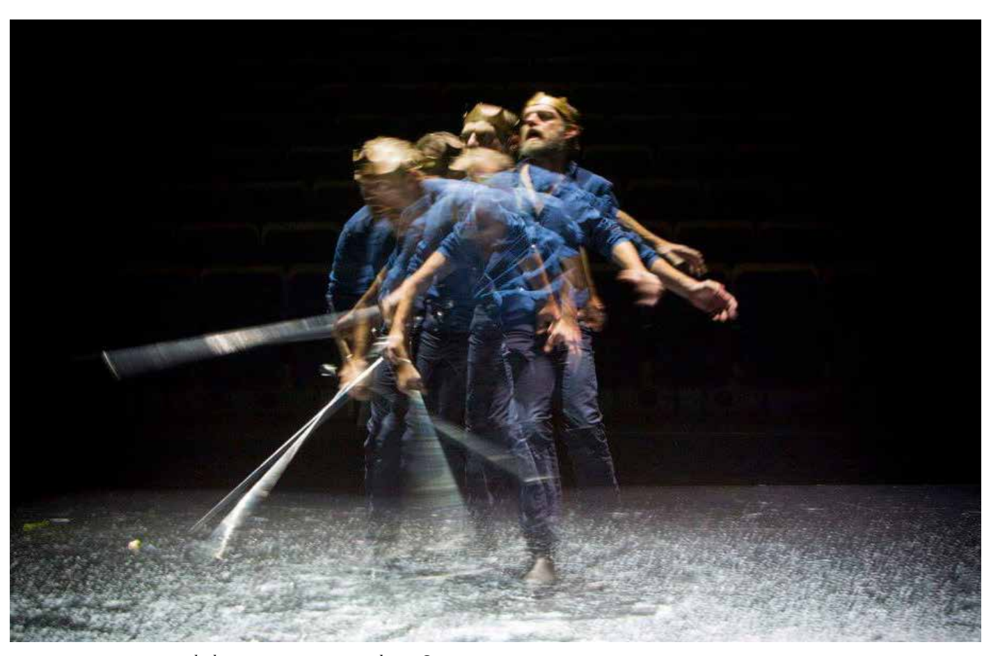
Hugo Weaving in STC's \mathit{Macbeth} , 2014. Image: Brett Boardman. ©