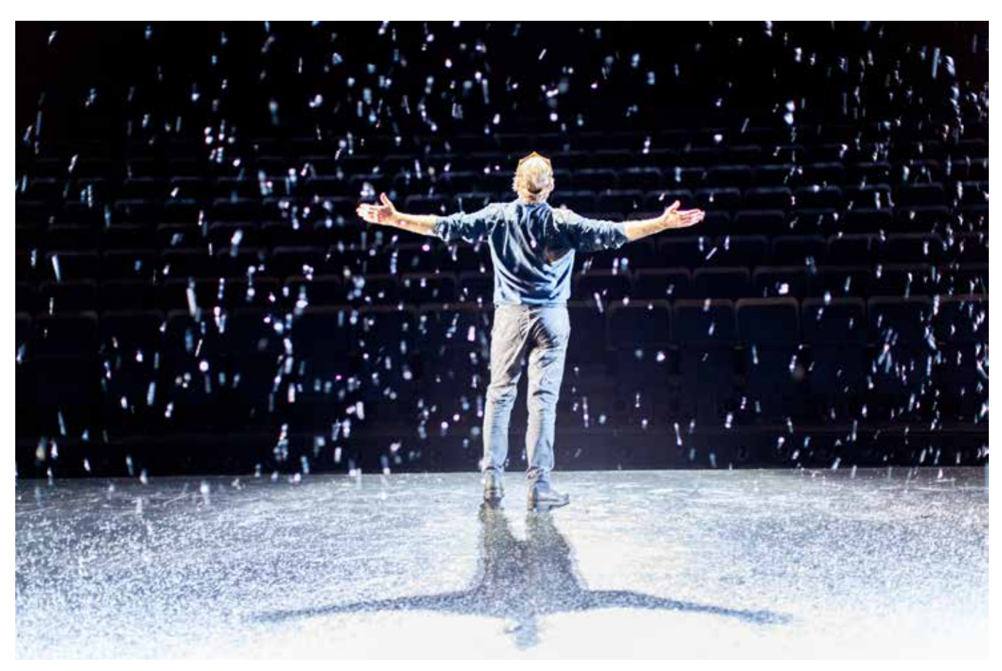
Hugo Weaving in STC's \mathit{Macbeth} , 2014.