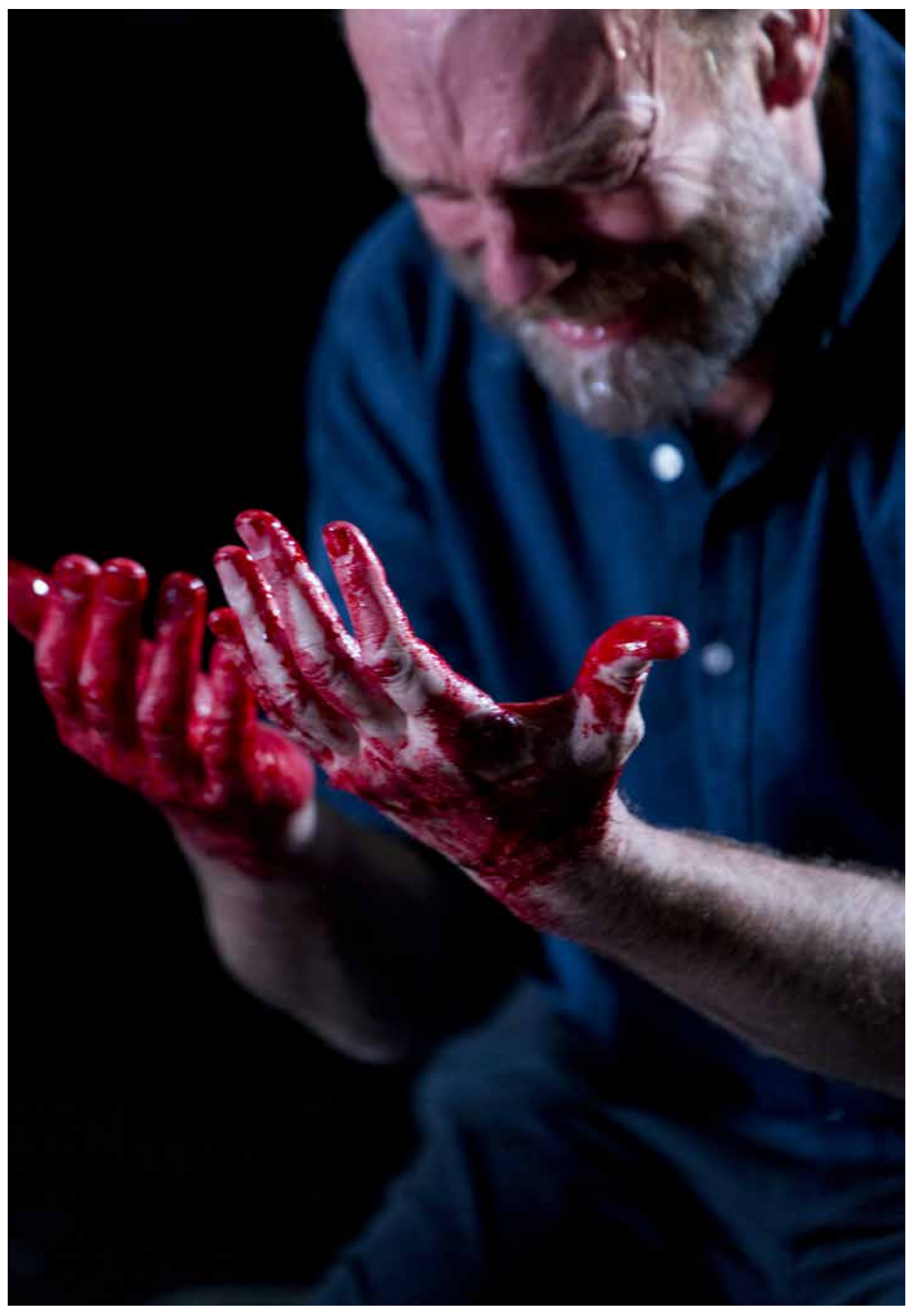
Hugo Weaving in STC's \mathit{Macbeth} , 2014.