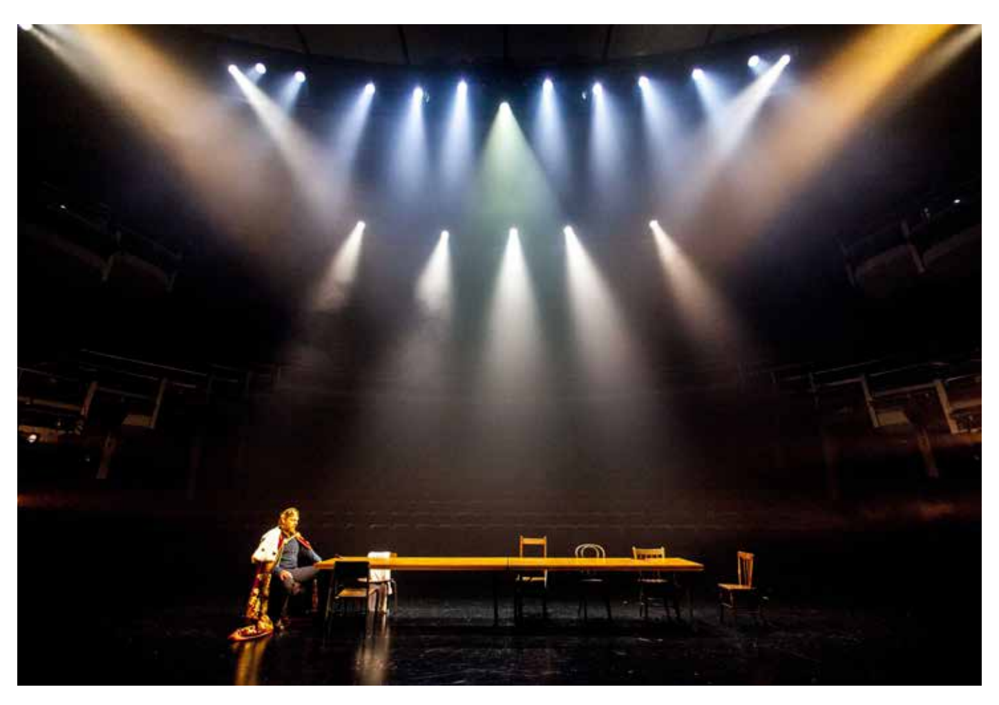
Hugo Weaving in STC's Macbeth, 2014.