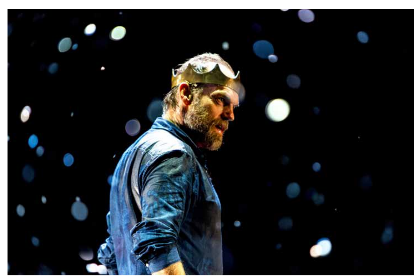
Hugo Weaving in STC's \mathit{Macbeth} , 2014.