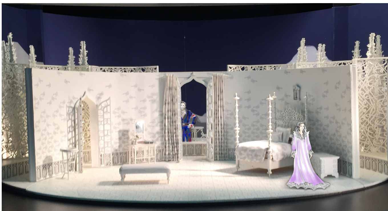
Bedroom set design with Captain Bluntschli and Raina for Arms and the Man.