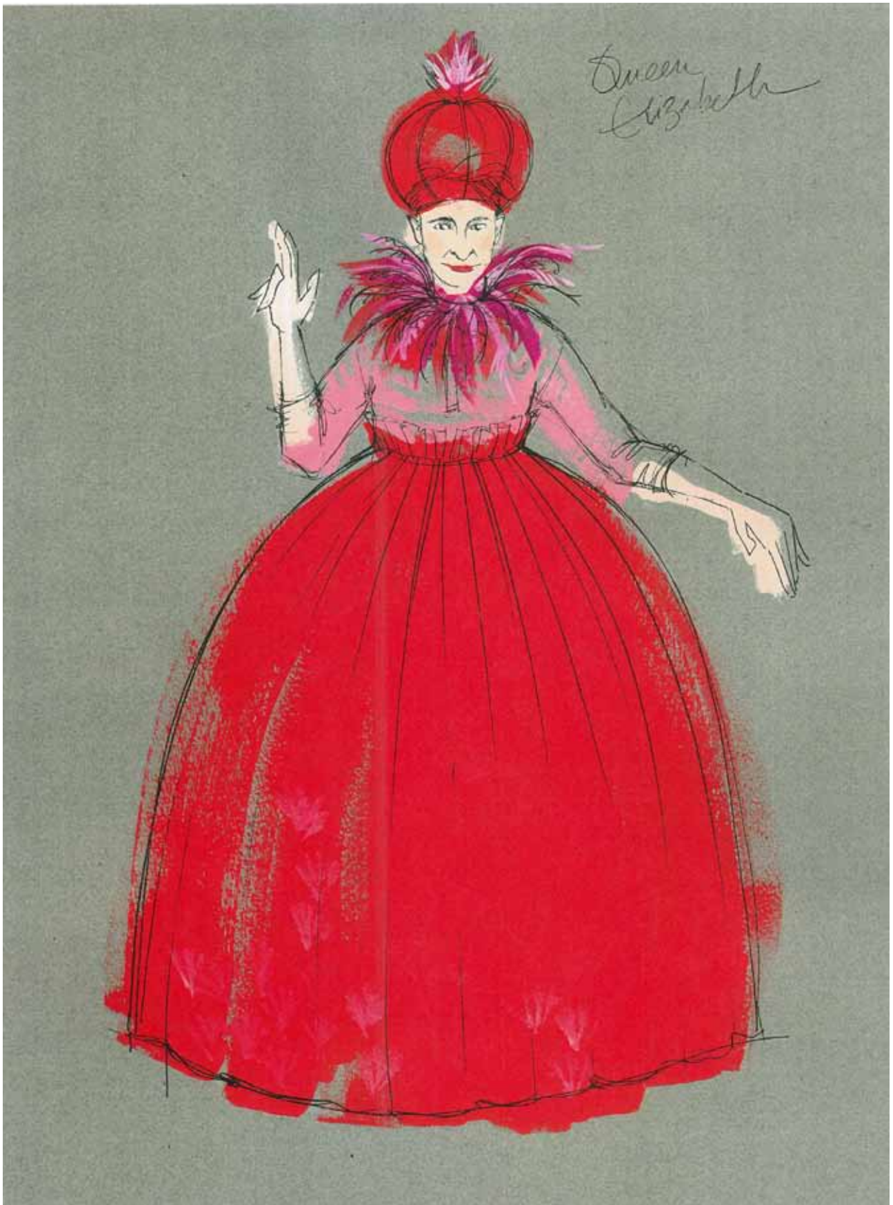
Costume design for Queen Elizabeth I in Orlando . (Costume Sketch: Renée Mulder. ©)