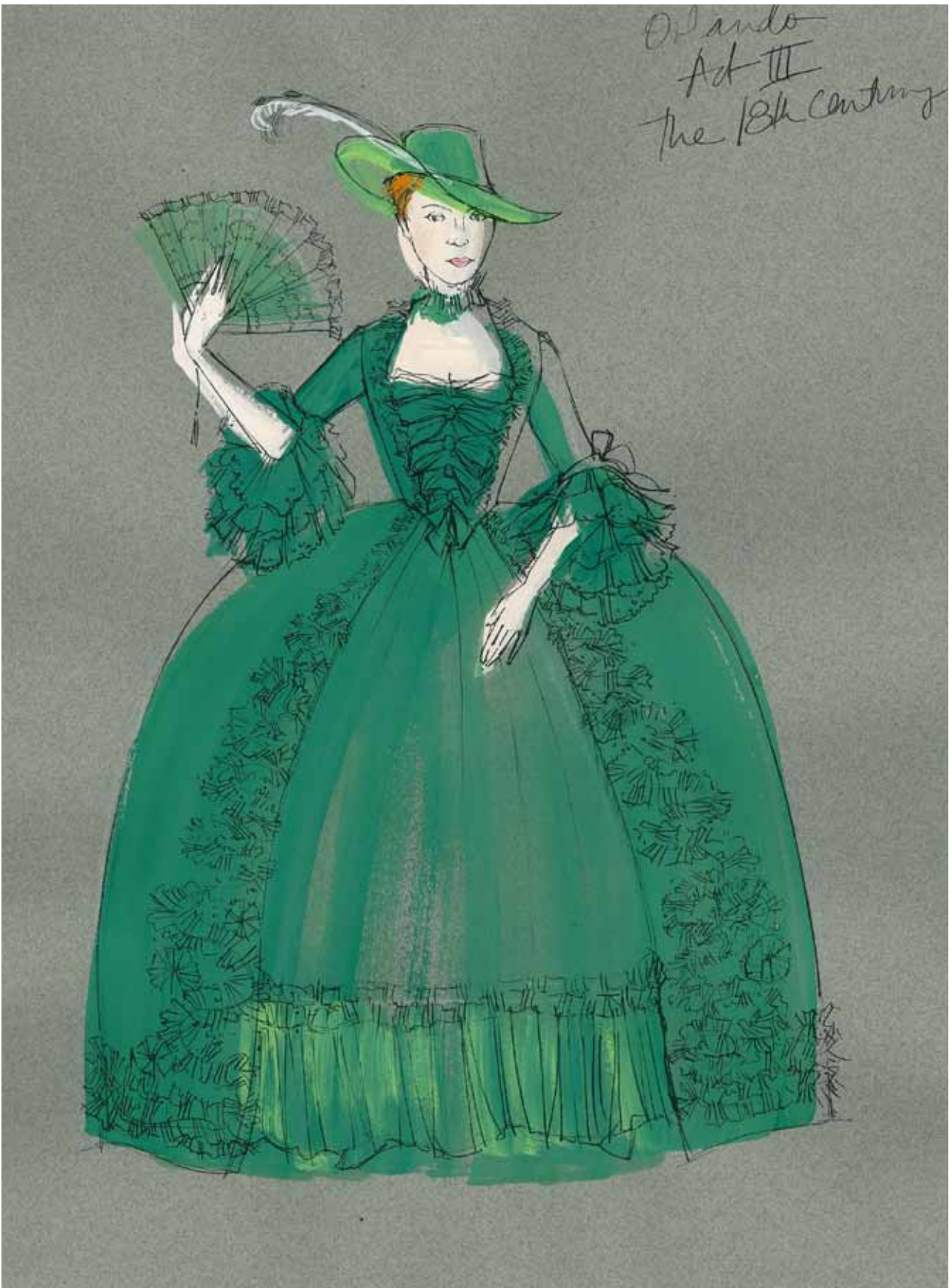
Costume design for 18th Century Orlando in Orlando . (Costume Sketch: Renée Mulder. ©)