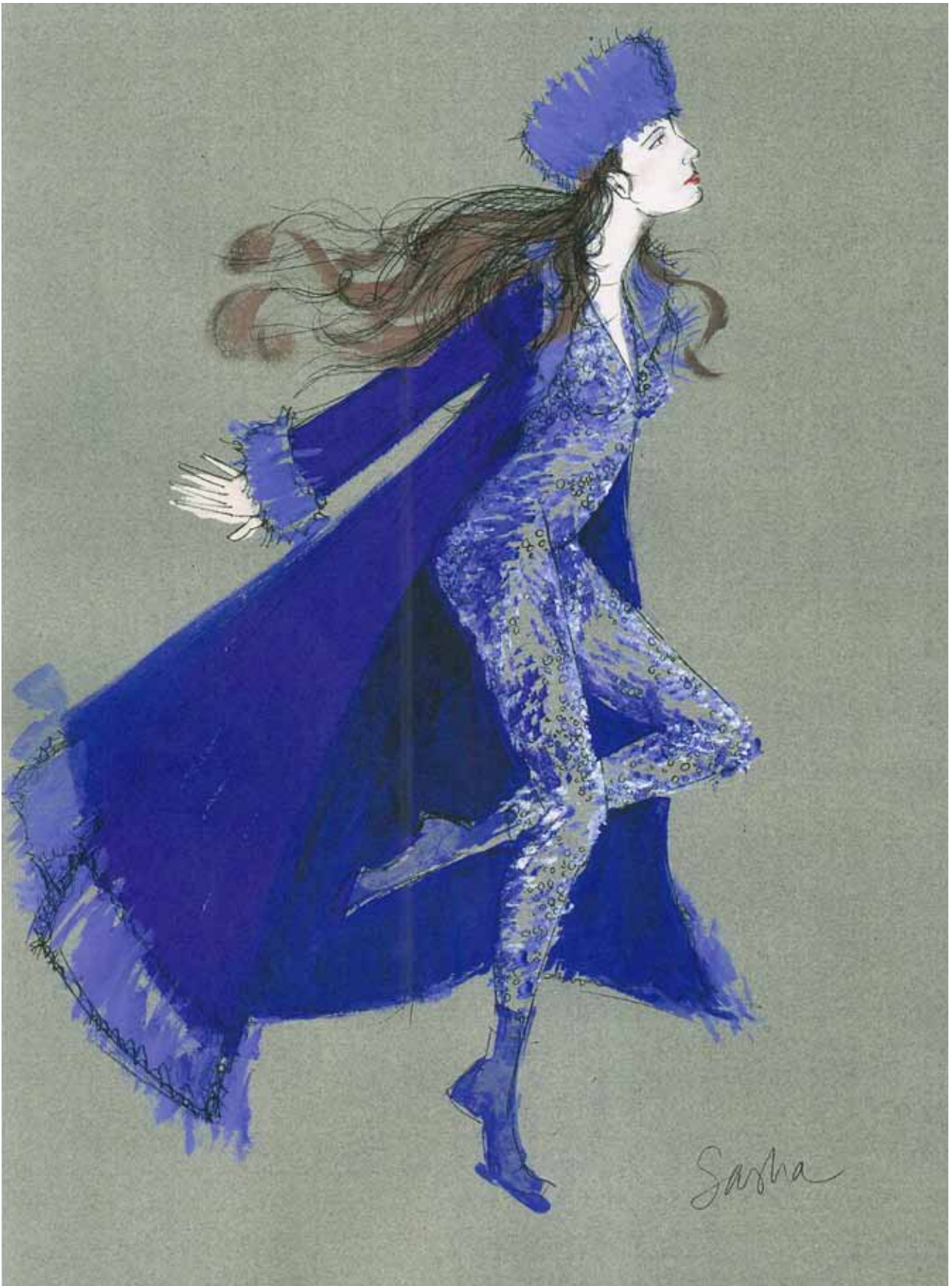
Costume design for Sasha in Orlando . (Costume Sketch: Renée Mulder. ©)