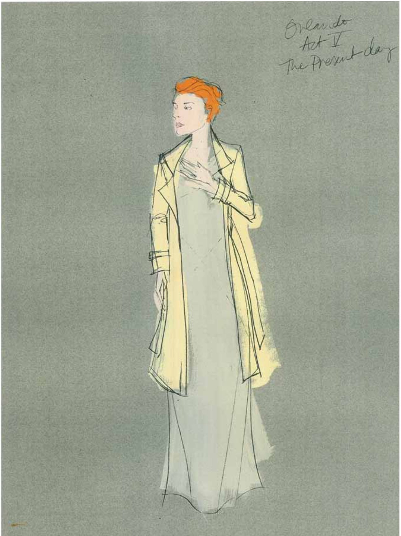
Costume design for present day Orlando in Orlando . (Costume Sketch: Renée Mulder. ©)