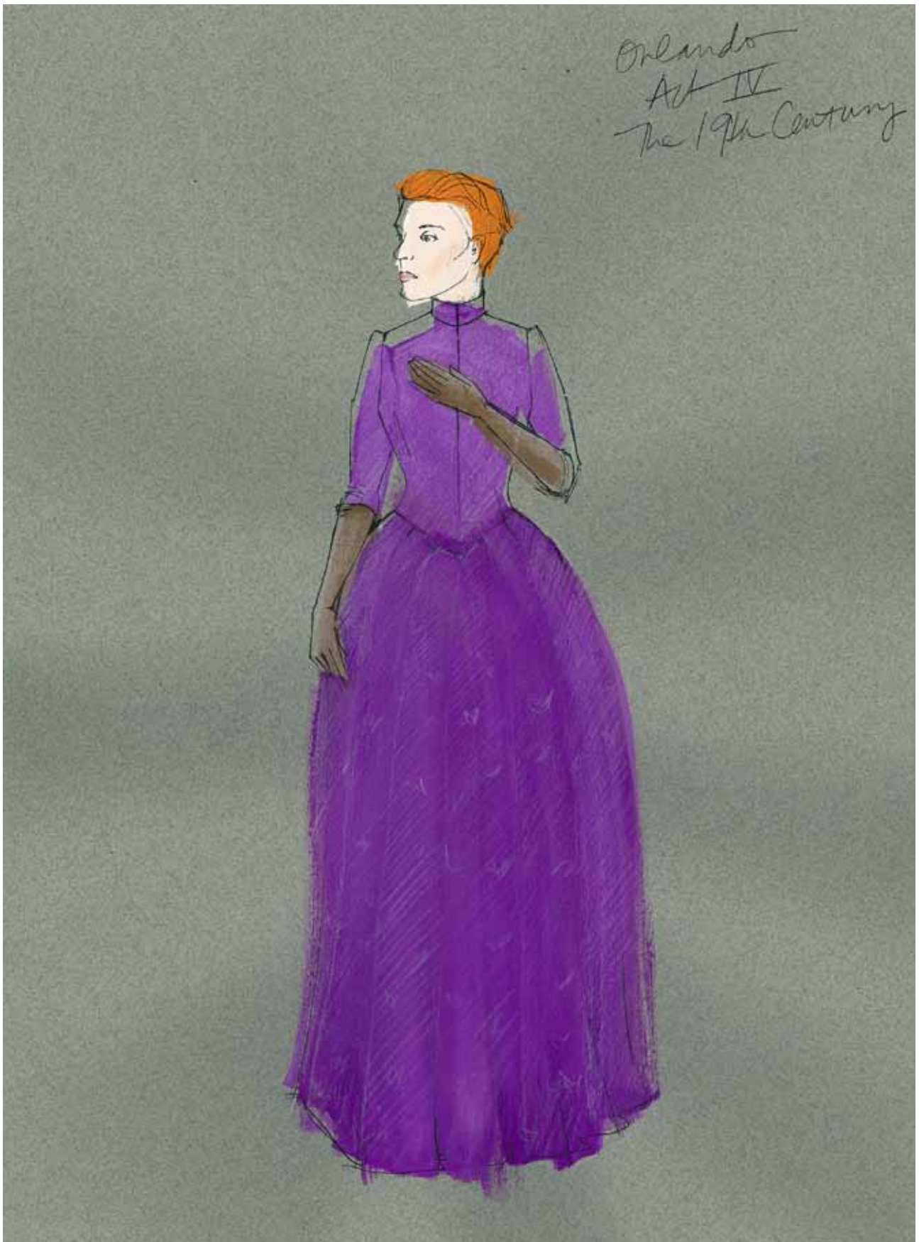
Costume design for 19th Century Orlando in Orlando . (Costume Sketch: Renée Mulder. ©)