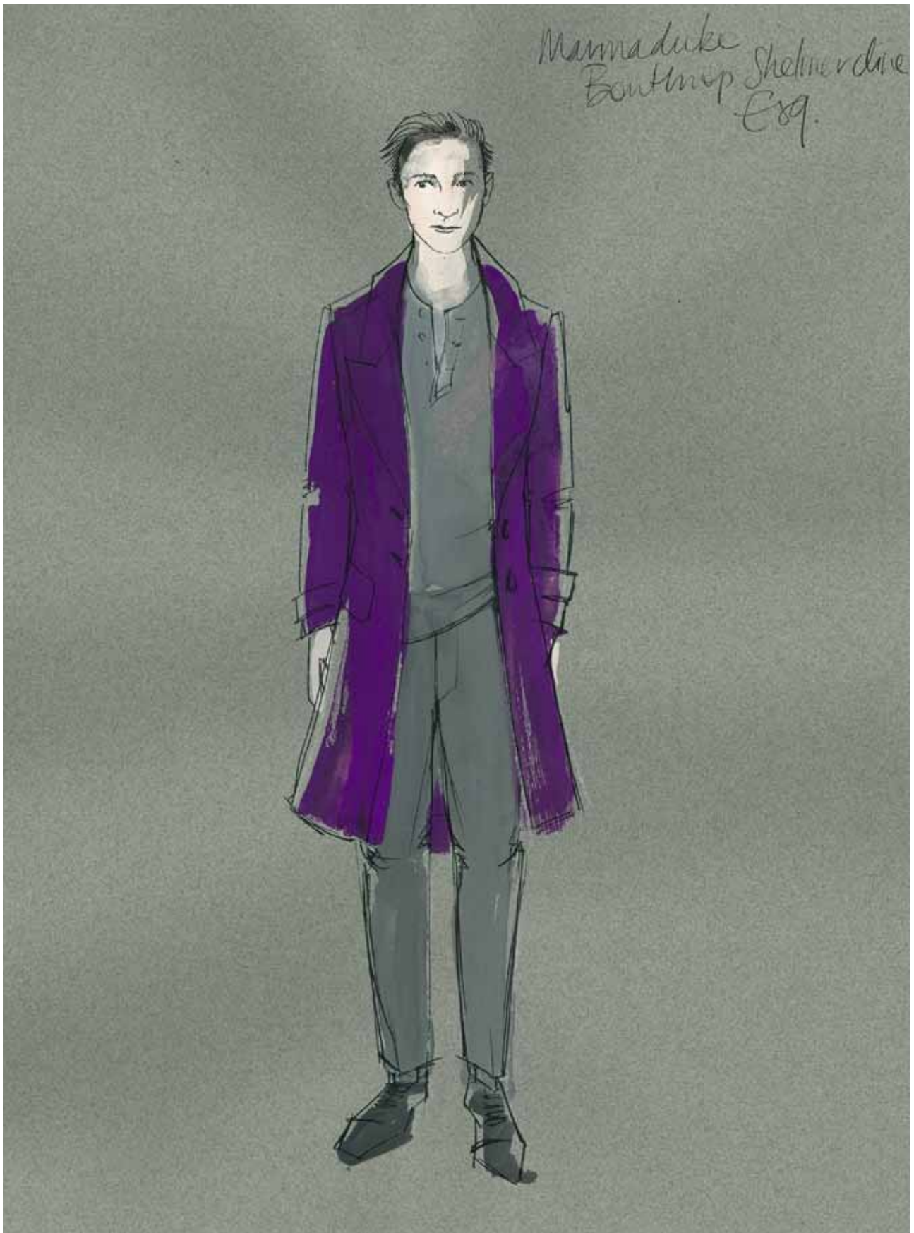
Costume design for Marmaduke Bonthrop Shelmerdine Esquire in Orlando . (Costume Sketch: Renée Mulder. ©)