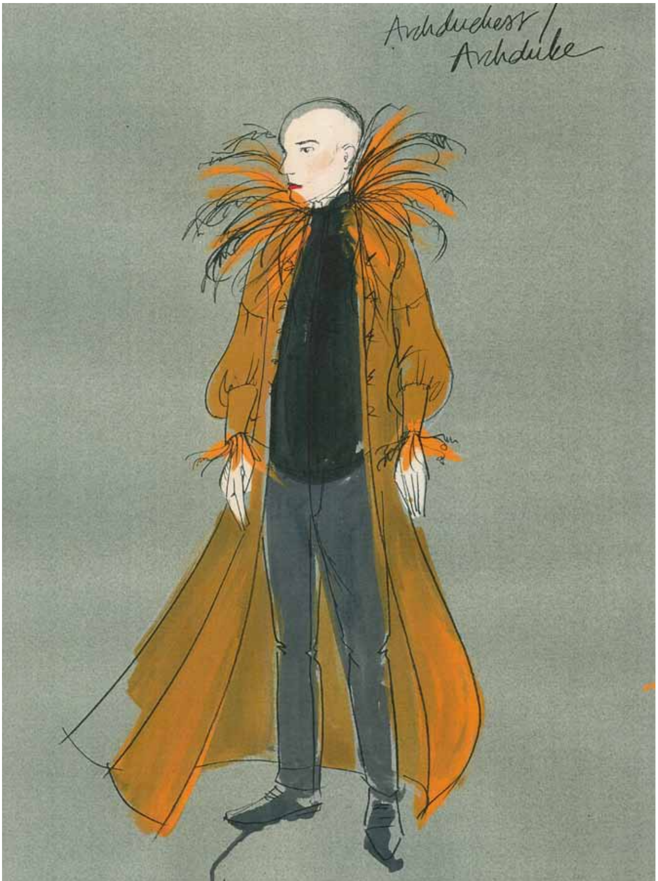
Costume design for the Archduchess/Archduke in Orlando . (Costume Sketch: Renée Mulder. ©)