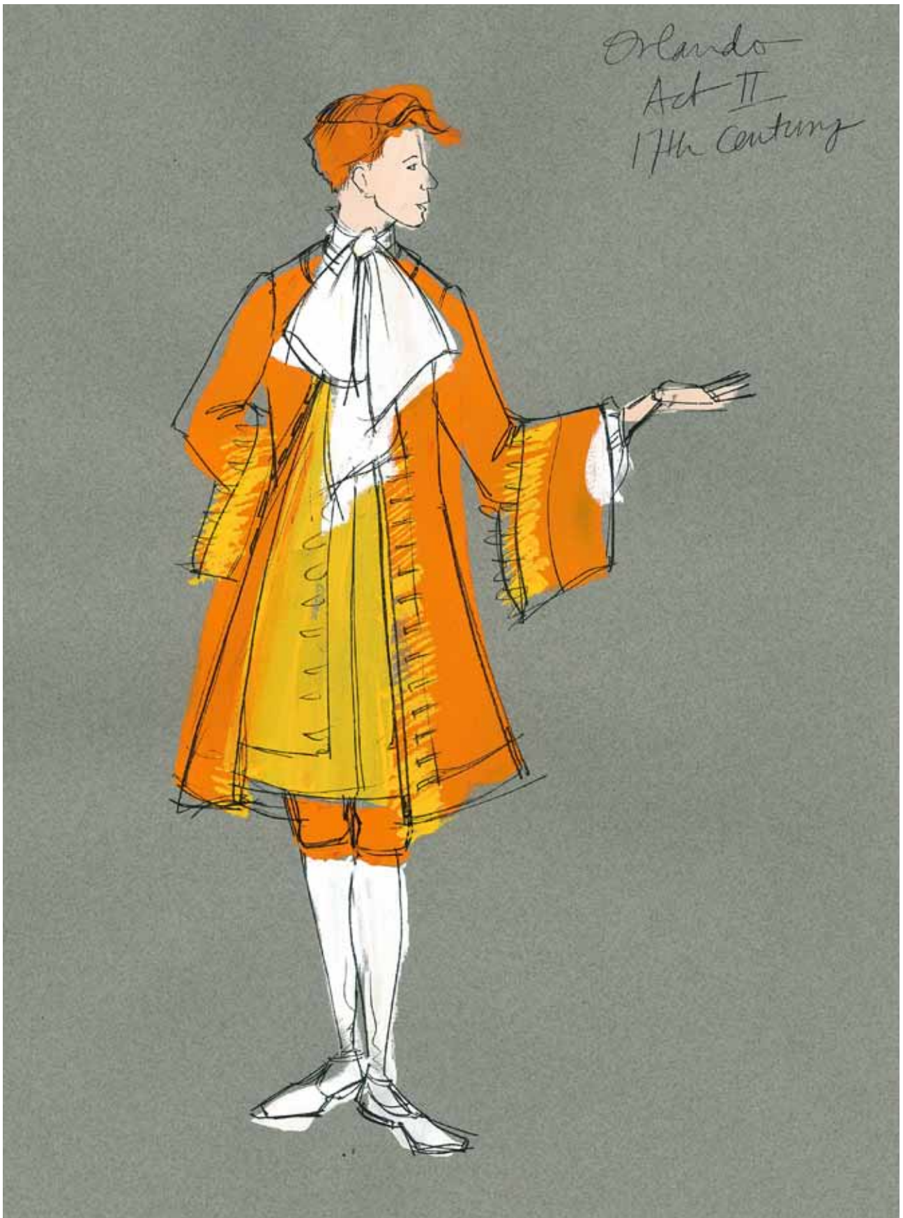
Costume design for 17th Century Orlando in Orlando . (Costume Sketch: Renée Mulder. ©)