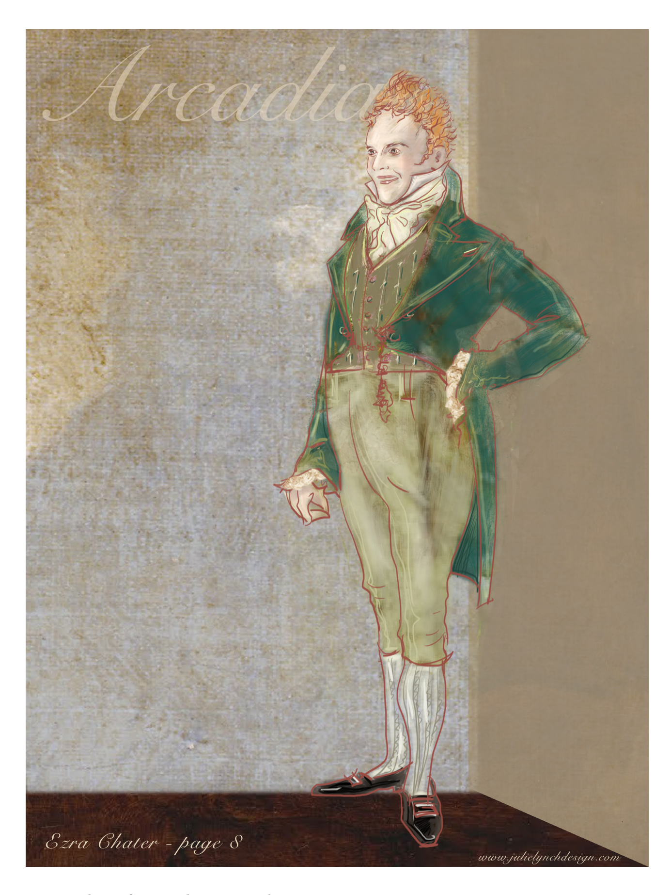
Costume design for Ezra Chater in Arcadia . (Costume Design: Julie Lynch. ©)