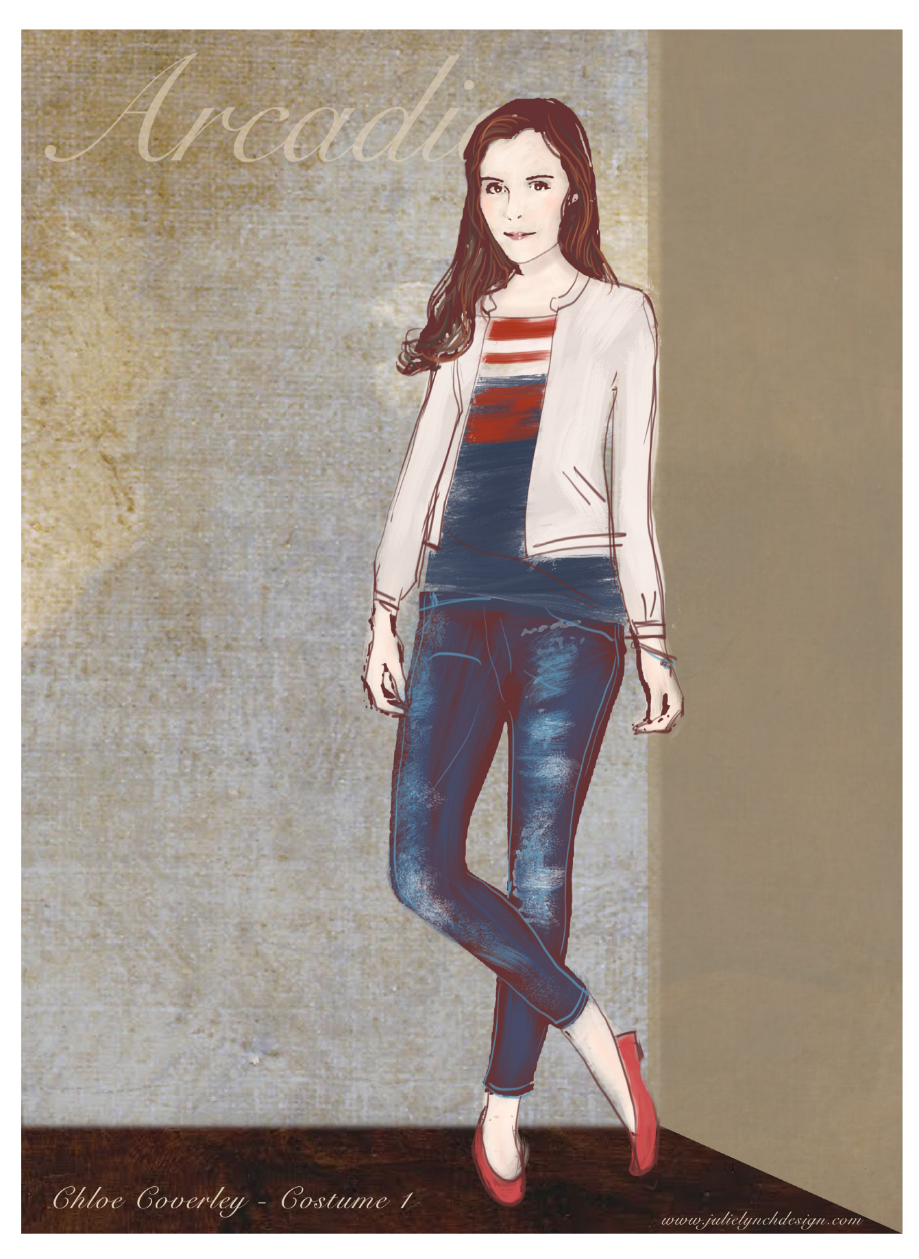
Costume design for Chloe Coverly in Arcadia . (Costume Design: Julie Lynch. ©)