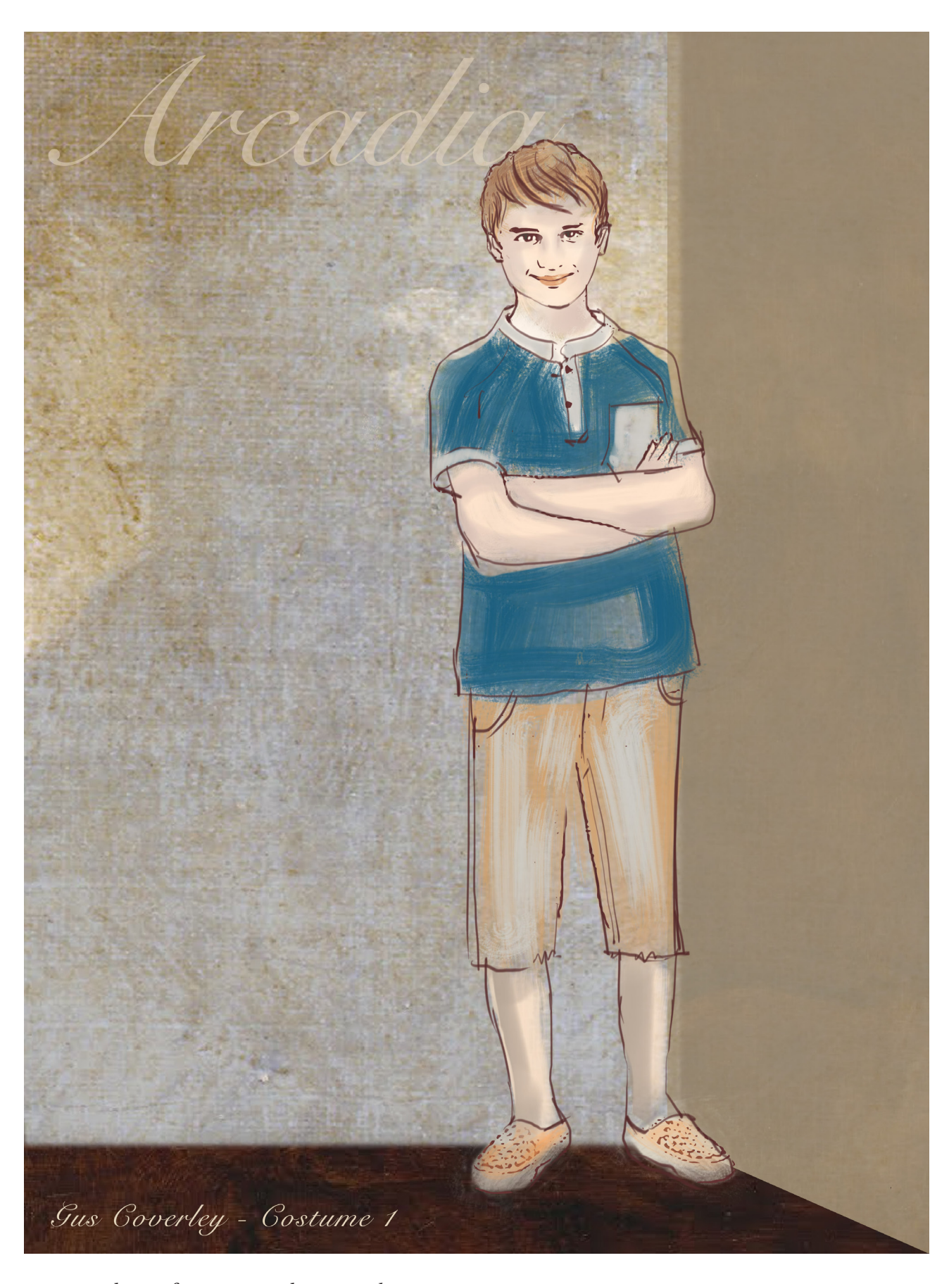
Costume design for Gus Coverly in Arcadia . (Costume Design: Julie Lynch. ©)