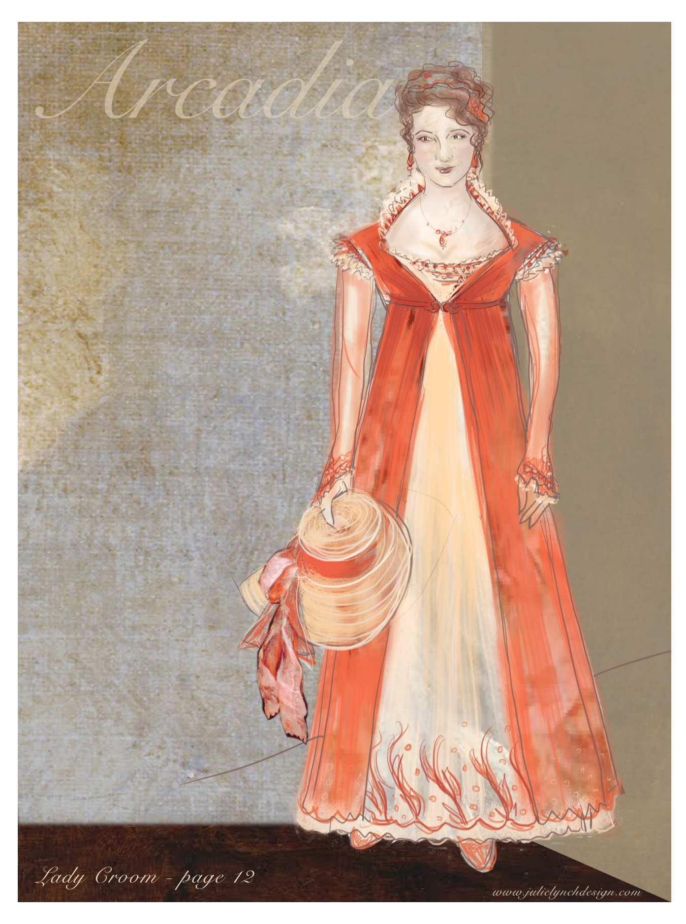
Costume design Lady Croom in Arcadia . (Costume Design: Julie Lynch. ©)