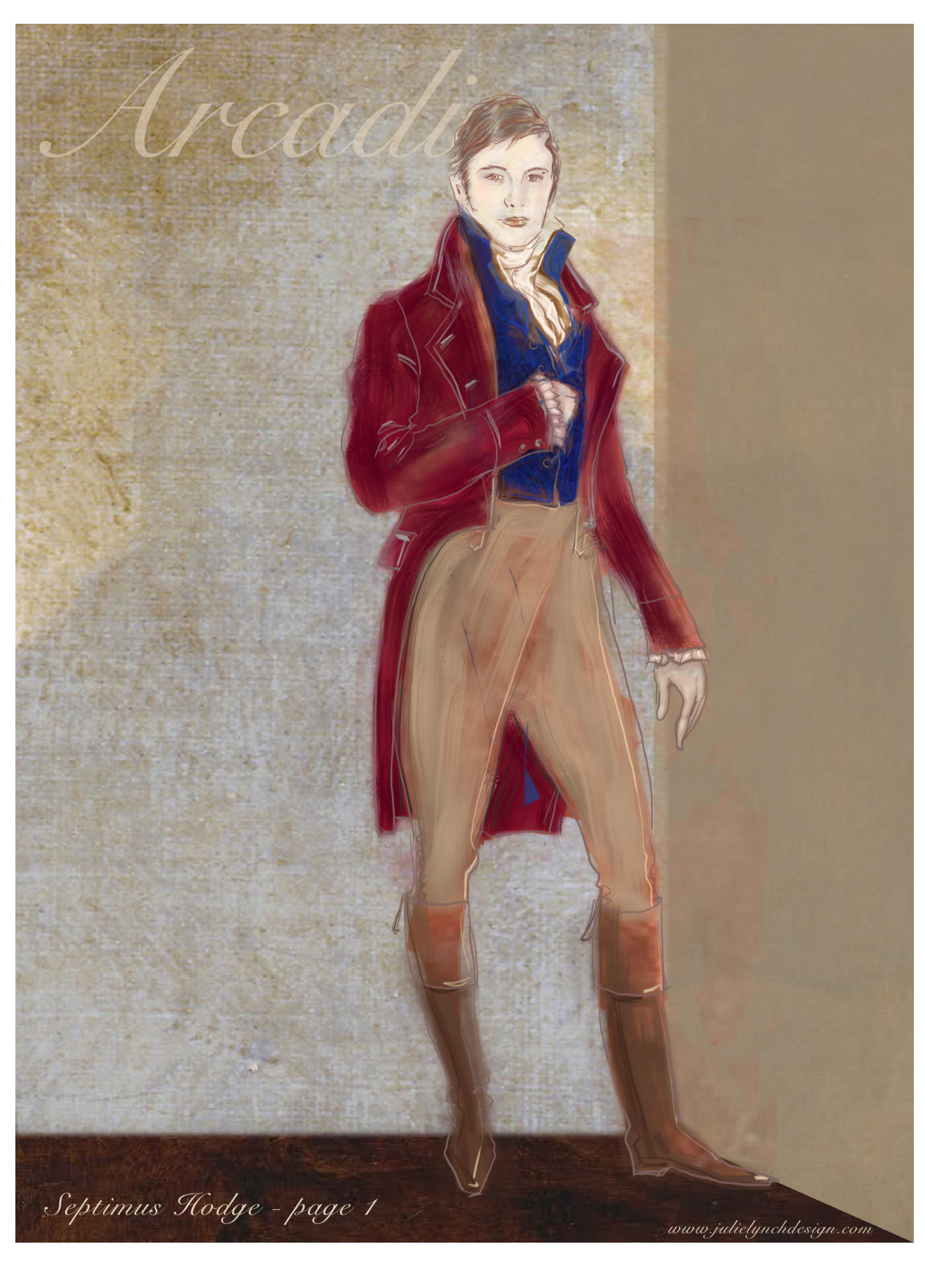
Costume design for Septimus Hodge in Arcadia . (Costume Design: Julie Lynch. ©)