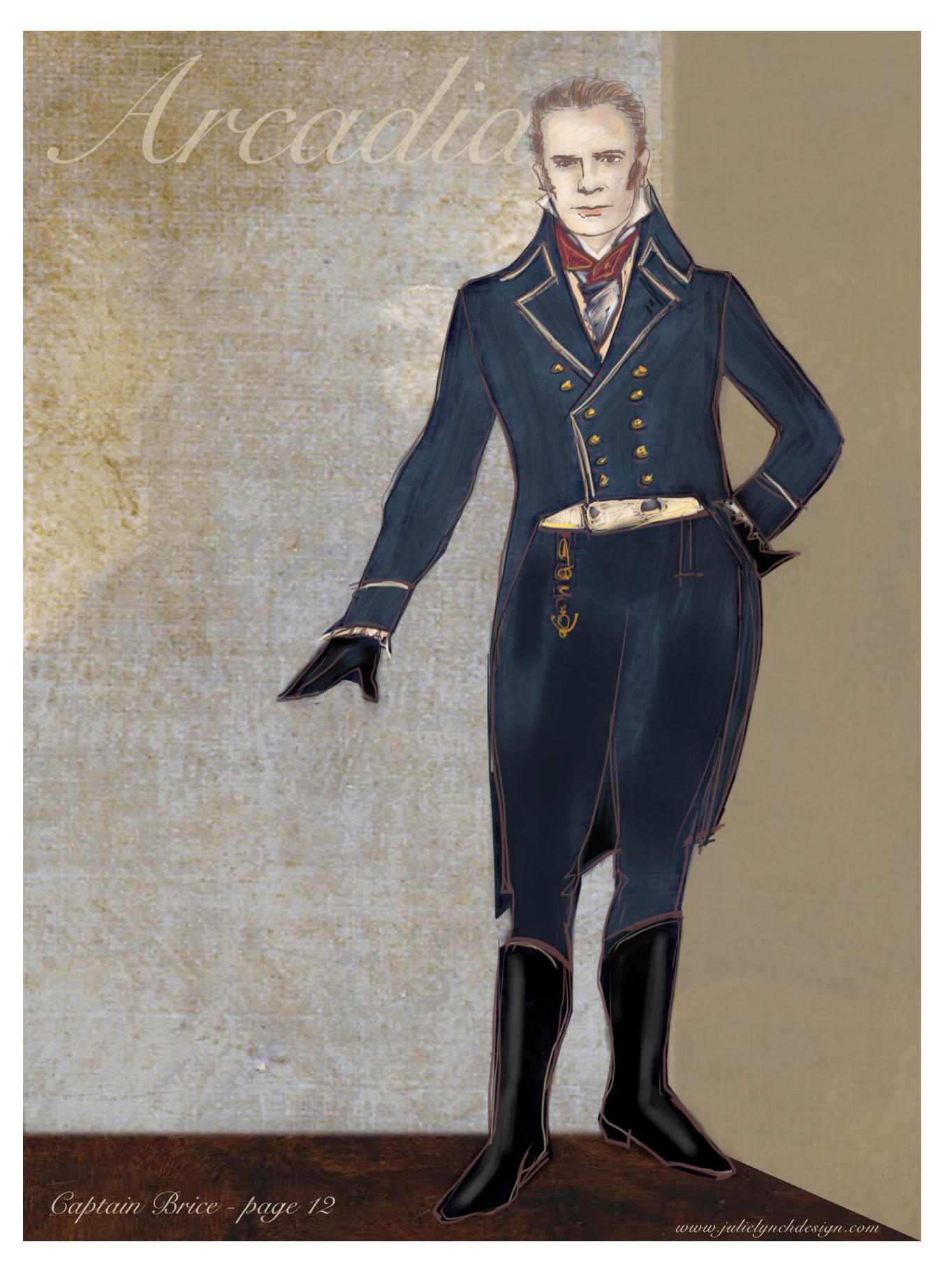
Costume design for Captain Brice in Arcadia.