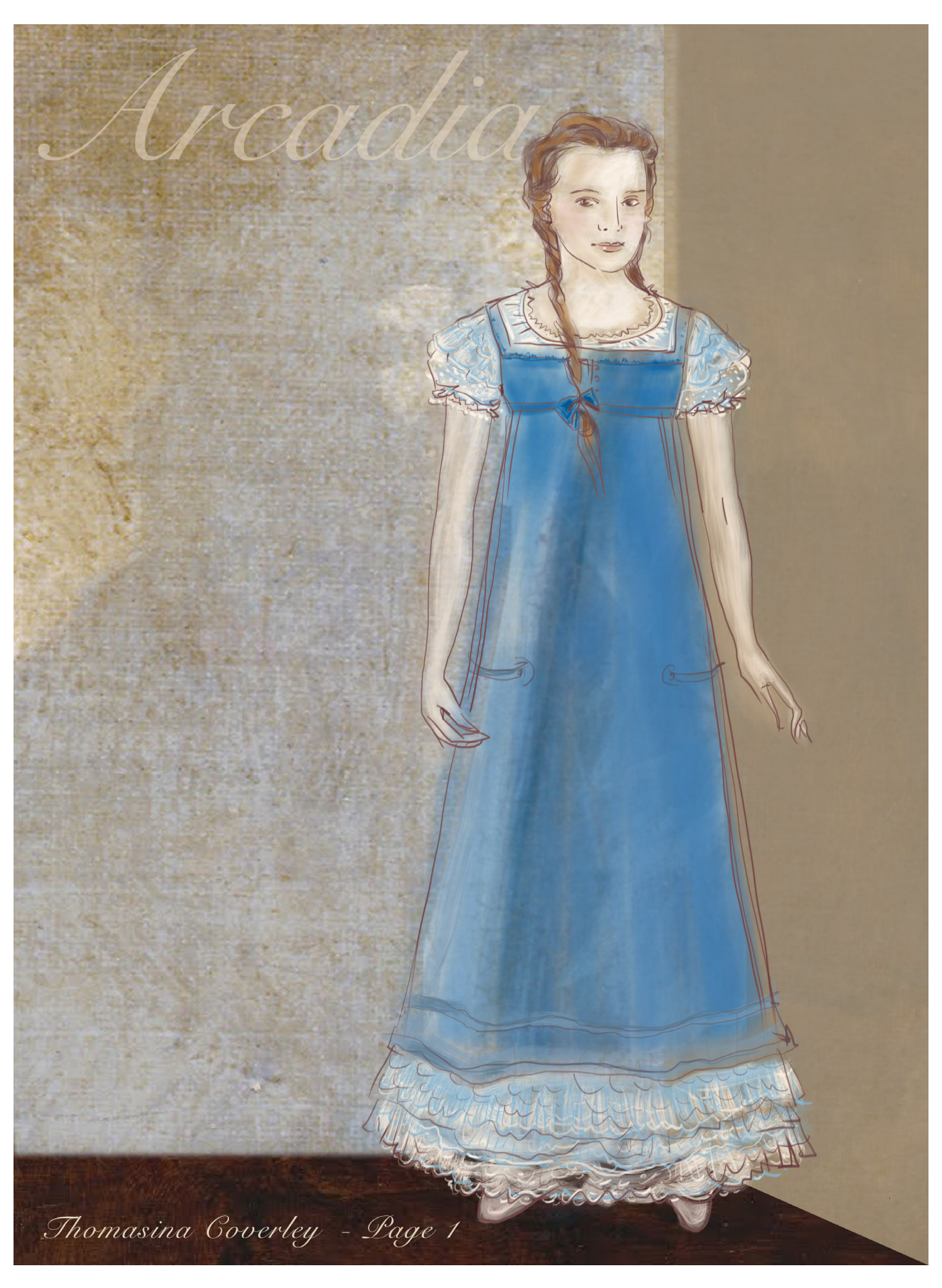
Costume design for Thomasina Coverly in Arcadia . (Costume Design: Julie Lynch. ©)