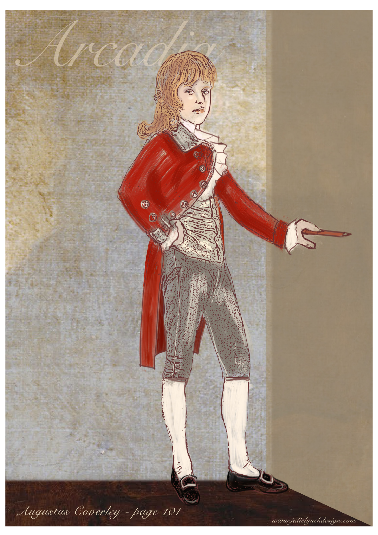
Costume design for Augustus Coverly in Arcadia. (Costume Design: Julie Lynch. \bigcirc )