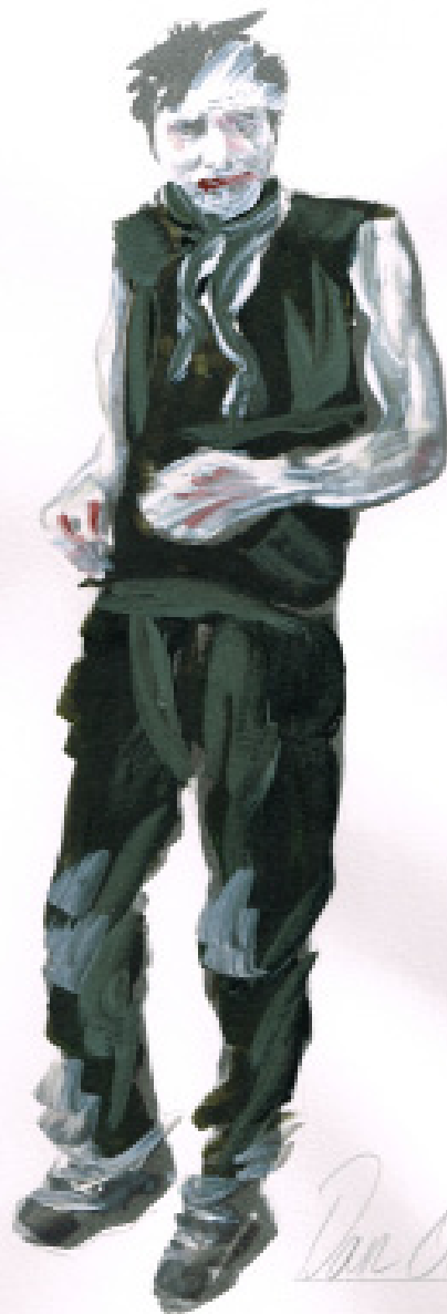
Costume design for Dan Oldfield in The Secret River . (Costume Sketch: Tess Schofield. ©)