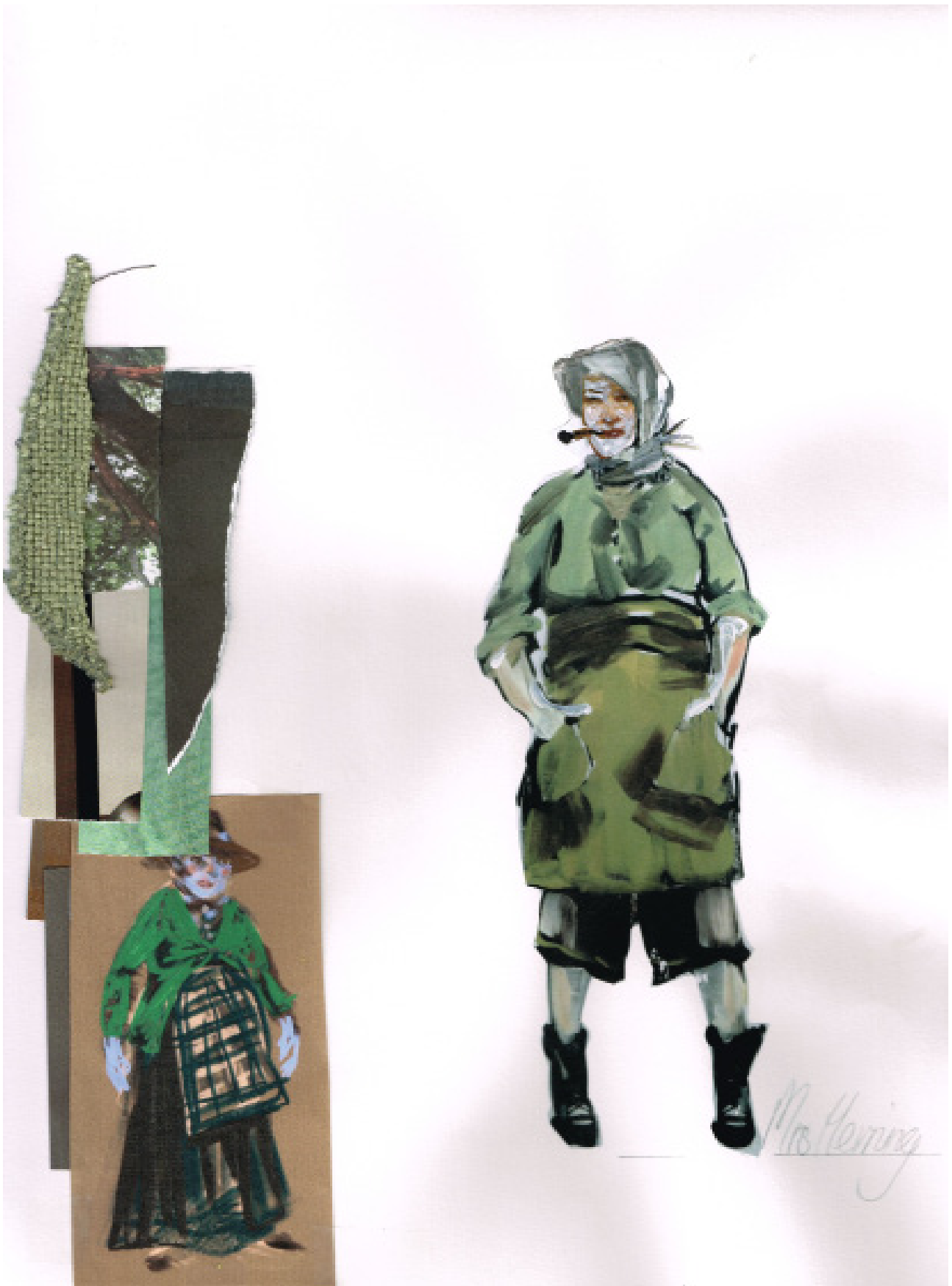
Costume design for Mrs. Herring in The Secret River.