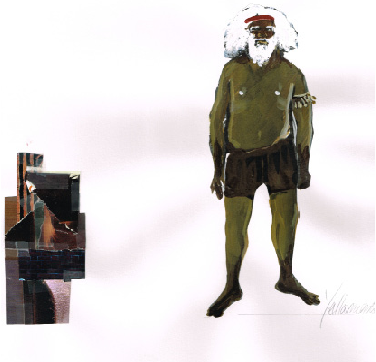
Costume design for Yalamundi in The Secret River . (Costume Sketch: Tess Schofield. ©)