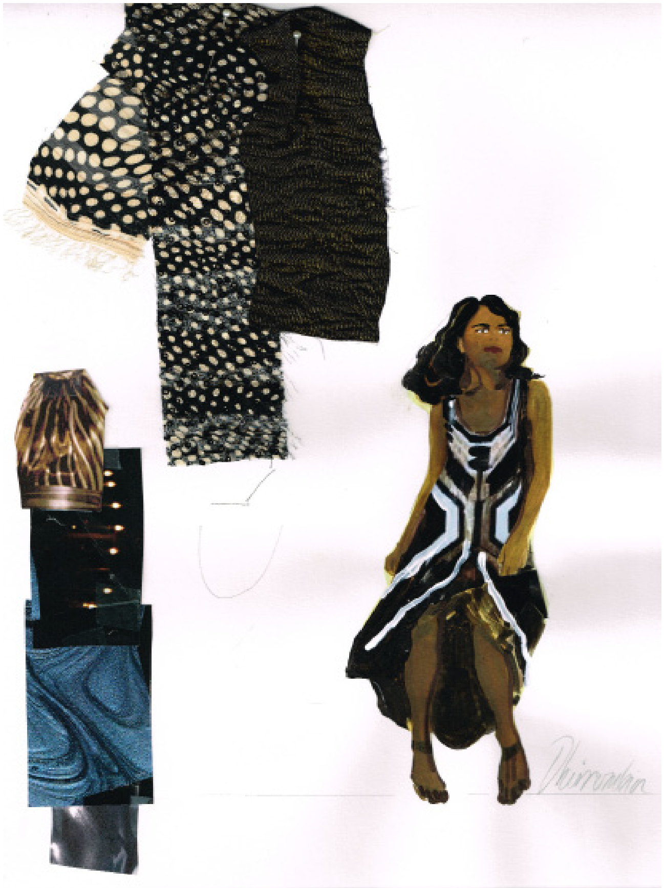
Costume design for Dhurrumin in The Secret River . (Costume Sketch: Tess Schofield. ©)