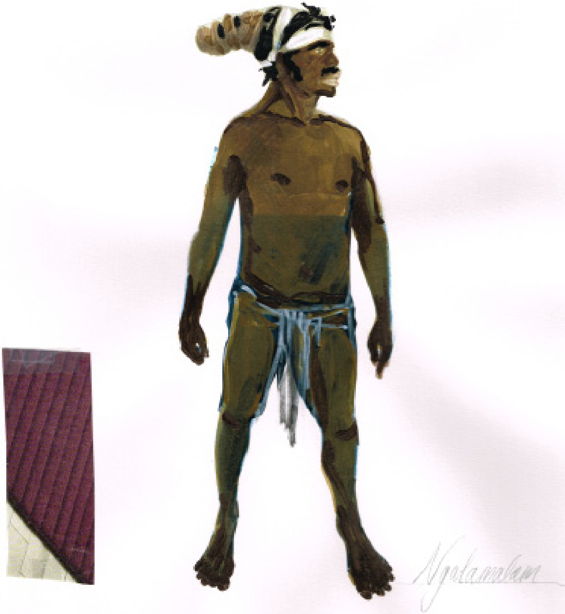
Costume design for Ngalamalum in The Secret River . (Costume Sketch: Tess Schofield. ©)