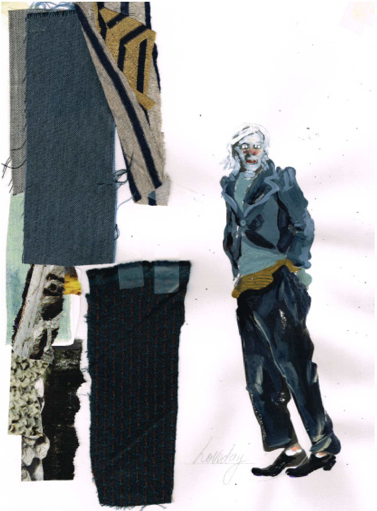
Costume design for Loveday in The Secret River . (Costume Sketch: Tess Schöfield. ©)