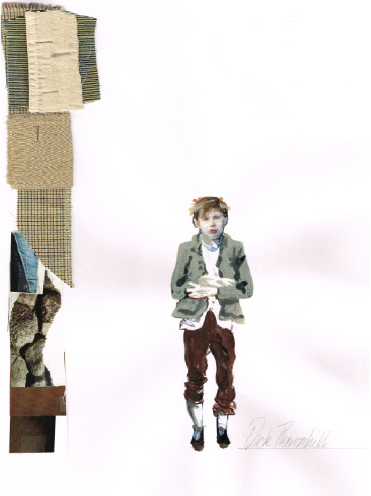
Costume design for Dick Thornhill in The Secret River . (Costume Sketch: Tess Schofield. ©)