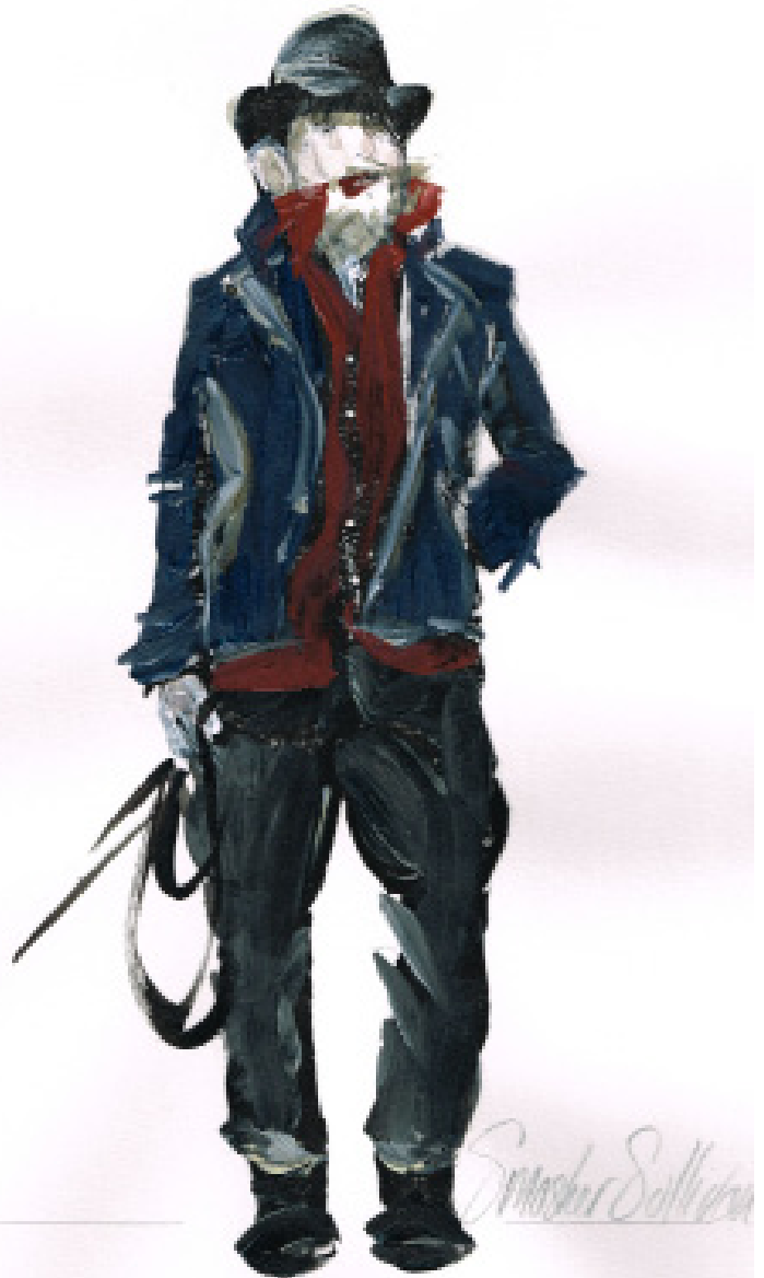
Costume design for Smasher Sullivan in The Secret River . (Costume Sketch: Tess Schofield. ©)