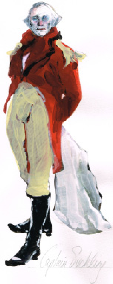
Costume design Captain Suckling in The Secret River . (Costume Sketch: Tess Schofield. ©)