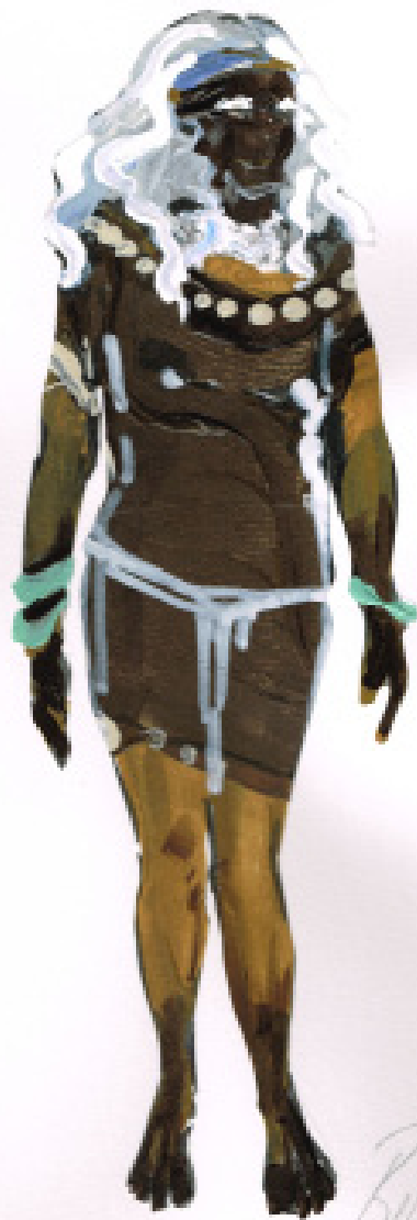
Costume design for Buriya in The Secret River . (Costume Sketch: Tess Schofield. ©)