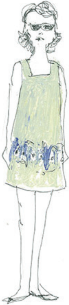
VIC. ACT 4