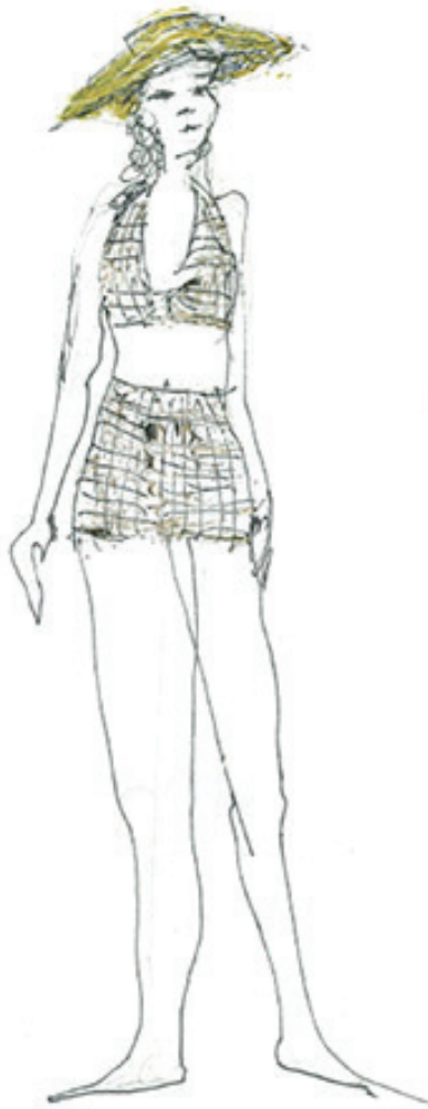
MEG ACT 4