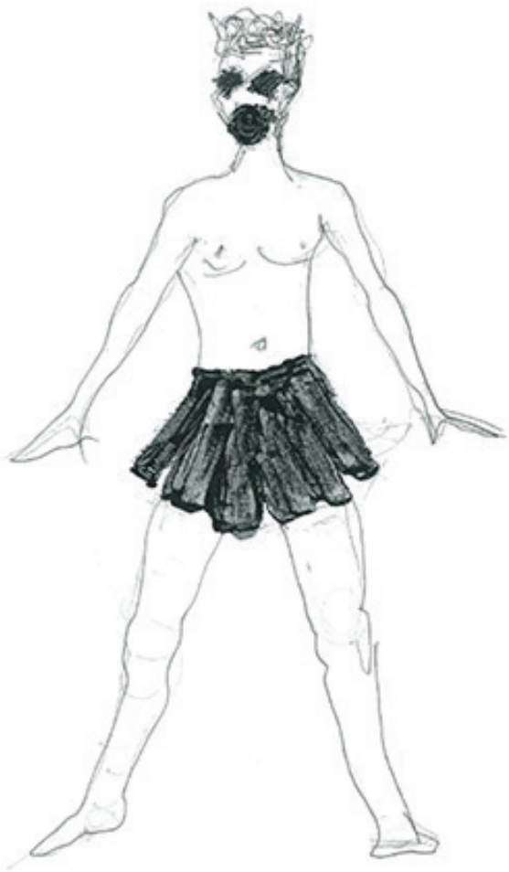
PUCK/TOM ACT 1 PROLOGUE