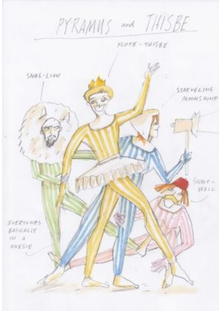
Costume drawing Jonathon Oxlade ©