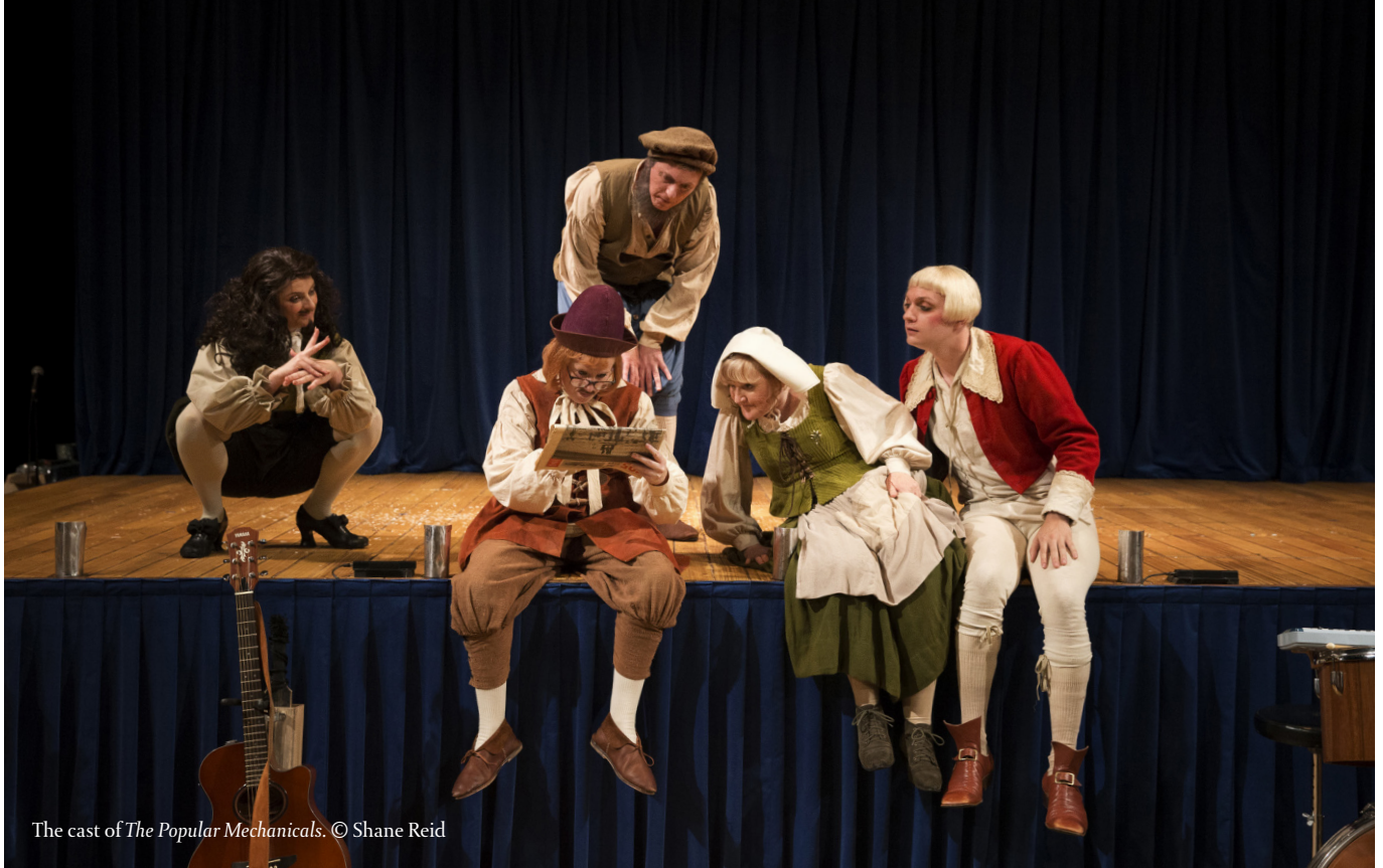
The cast of The Popular Mechanicals .