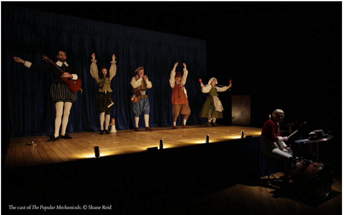
The cast of The Popular Mechanicals.

Explore friendship. Who are you friends with? Create a Mind Map/ Radial hierarchy of who your friends are. Maybe your friends include family, or cousins or even pets?