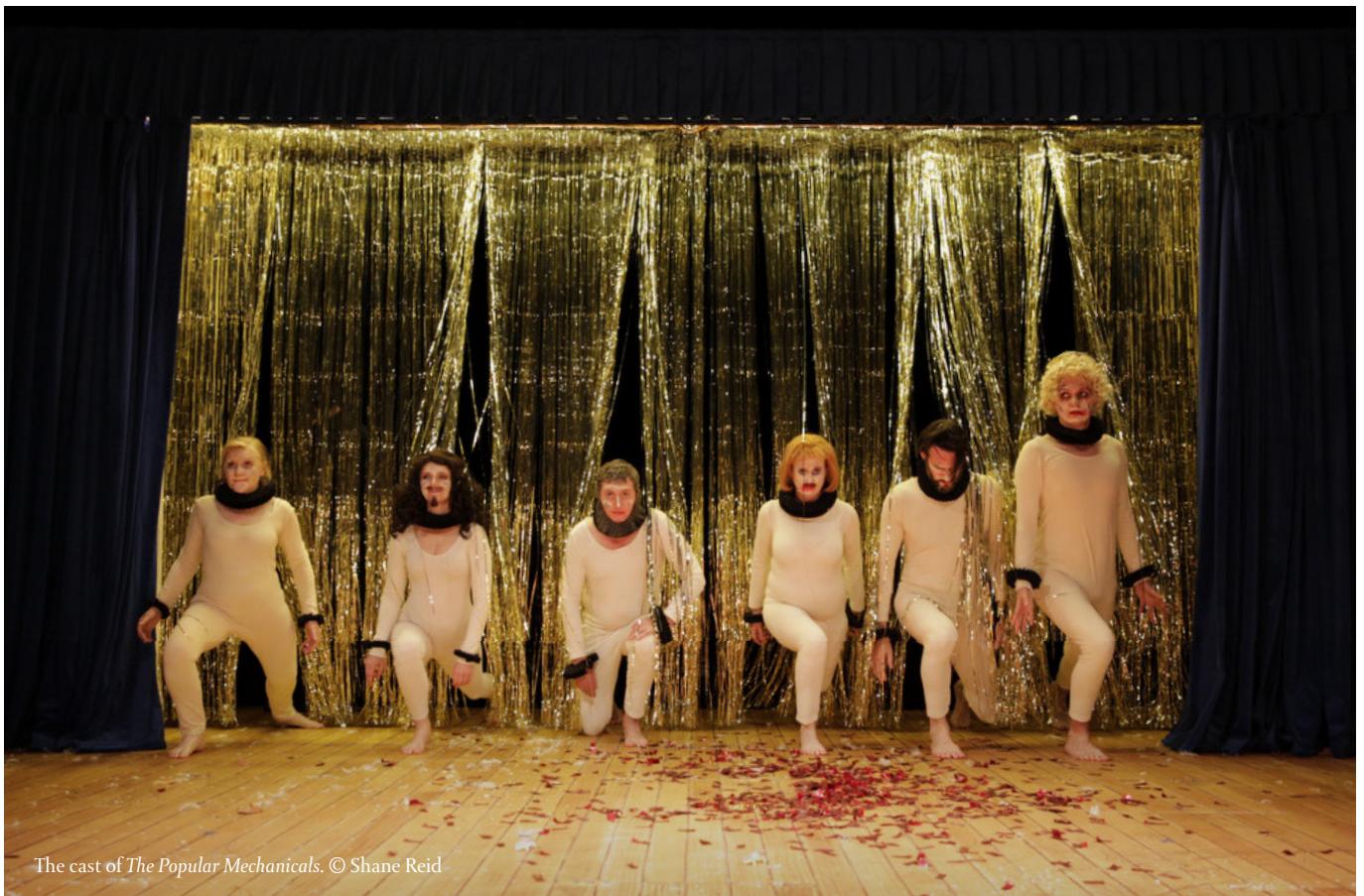
The cast of The Popular Mechanicals . © Shane Reid

In the Ovidian version, Pyramus and Thisbe are two lovers in the city of Babylon who occupy connected houses/walls, forbidden by their parents to be wed, because of their parents' rivalry. Through a crack in one of the walls, they whisper their love for each other. They arrange to meet near Ninus' tomb under a mulberry tree and state their feelings for each other. Thisbe arrives first, but upon seeing a lioness with a mouth bloody from a recent kill, she flees, leaving behind her veil. When Pyramus arrives he is horrified at the sight of Thisbe's veil, assuming that a wild beast has killed her. Pyramus kills himself, falling on his sword in proper Roman fashion, and in turn splashing blood on the mulberry fruits, turning them dark. Thisbe returns, eager to tell Pyramus what had happened to her, but she finds Pyramus' dead body under the shade of the mulberry tree. Thisbe, after a brief period of mourning, stabs herself with the same sword. In the end, the Gods listen to Thisbe's lament, and forever change the colour of the mulberry fruits into the stained colour to honour the forbidden love.