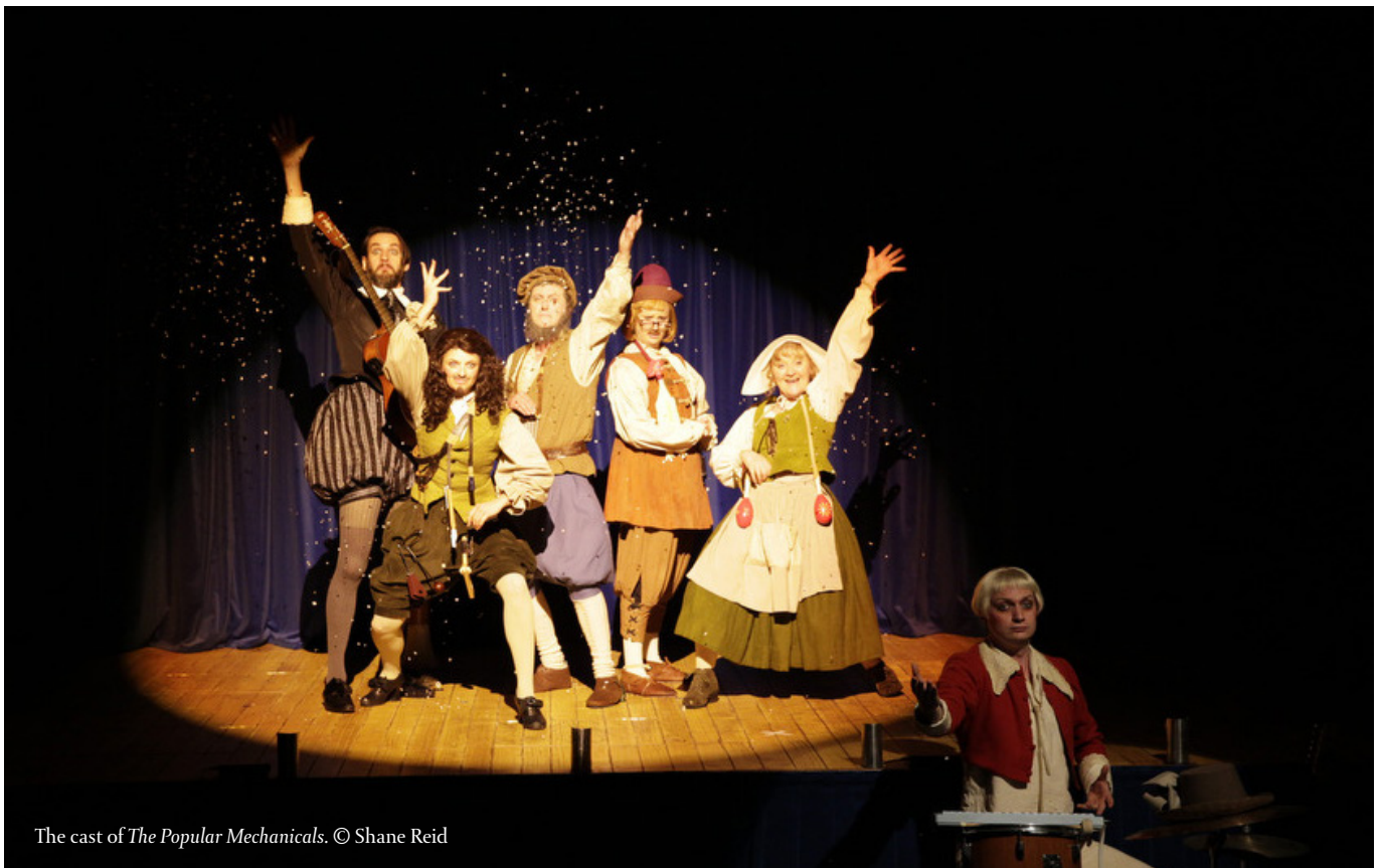
The cast of The Popular Mechanicals .

Snout joins him onstage doing his own impressions and telling jokes. The two start discussing the difference between poetry and prose, before bursting into song and dance to “ Merry England ” and are gradually joined by the full company. The scene ends with the men standing in perfect tableau same as the end of Scene 7.