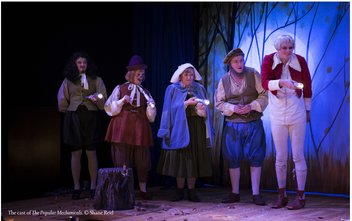
The cast of The Popular Mechanicals.

A tailor originally chosen to play Thisbe's mother, he ends up playing the part of the moonshine. Starveling is one of the most easygoing of the group members, accepting her role without dispute, and attempting to learn her lines between work calls.