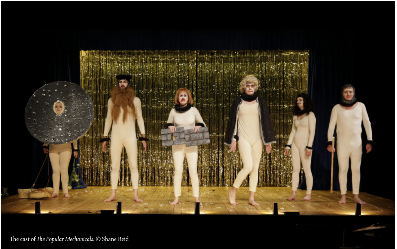
The cast of The Popular Mechanicals .