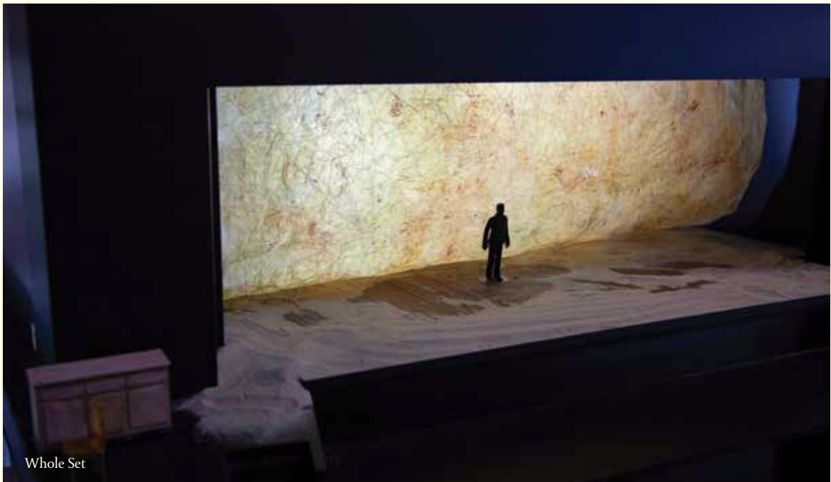
Set Design for The Long Forgotten Dream (Model Box: Jacob Nash 2018. ©)