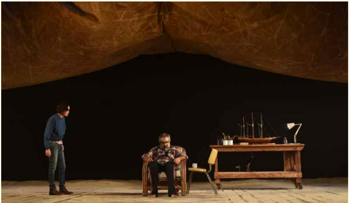
The Set Design realised on stage for The Long Forgotten Dream (Set Design: Jacob Nash 2018. ©)