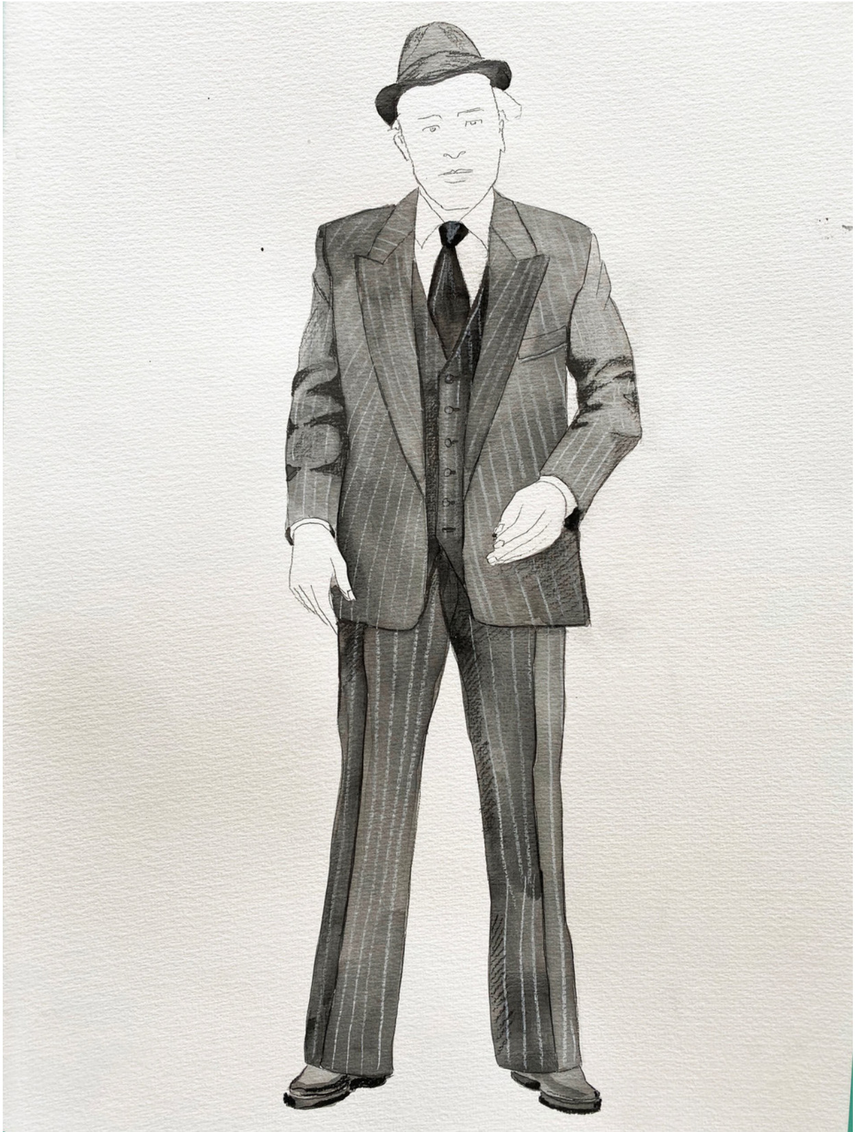
Costume design for Undertaker in No Pay? No Way! . (Costume Sketch: Charles Davis 2020. ©)