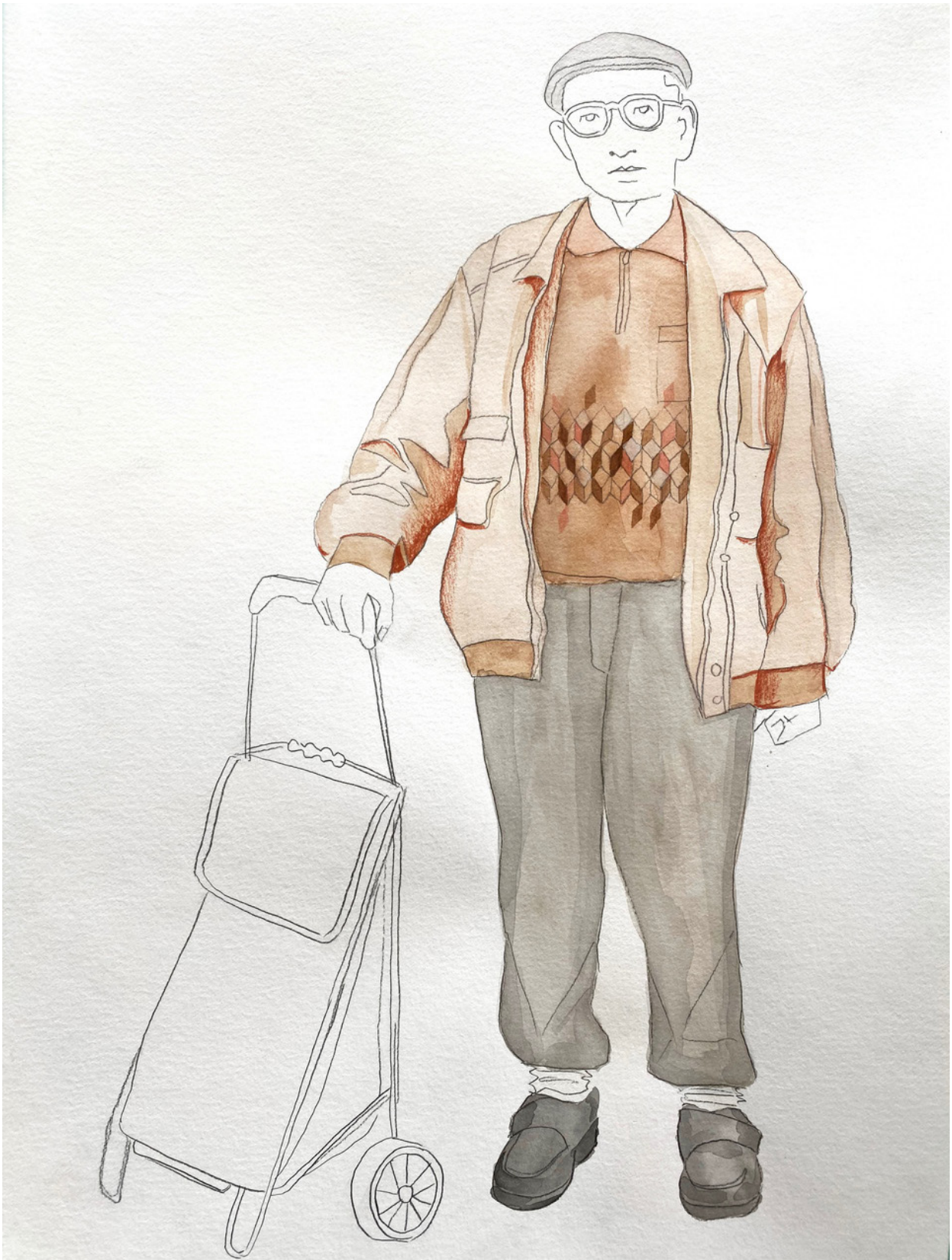
Costume design for Old Man in No Pay? No Way! . (Costume Sketch: Charles Davis 2020. ©)