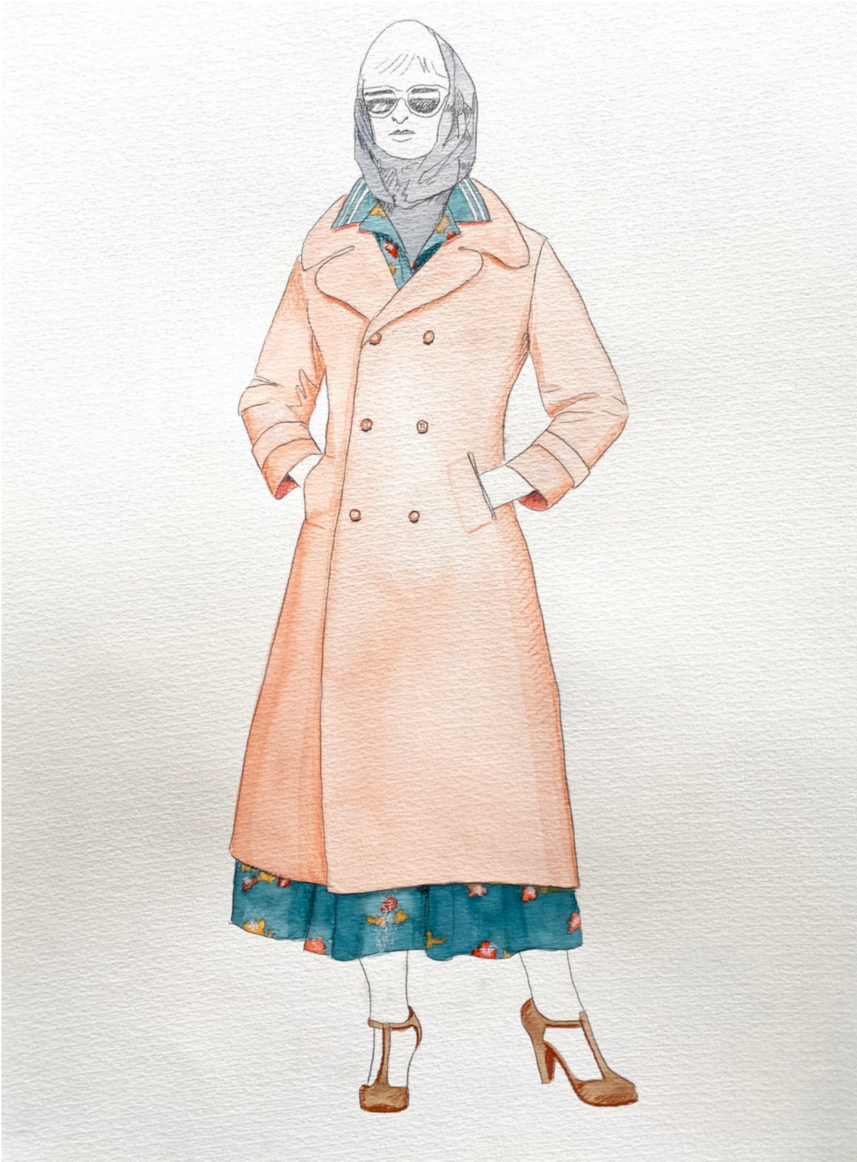
Costume design for Antonia in No Pay? No Way! . (Costume Sketch: Charles Davis 2020. ©)