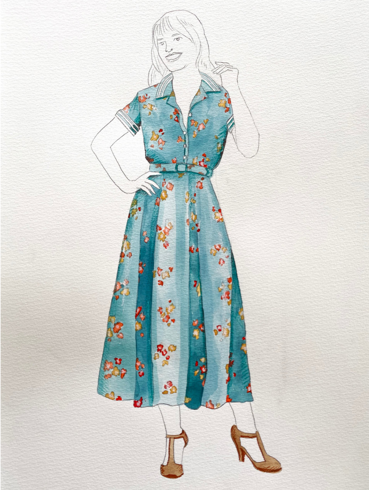
Costume design for Antonia in No Pay? No Way! . (Costume Sketch: Charles Davis 2020. ©)