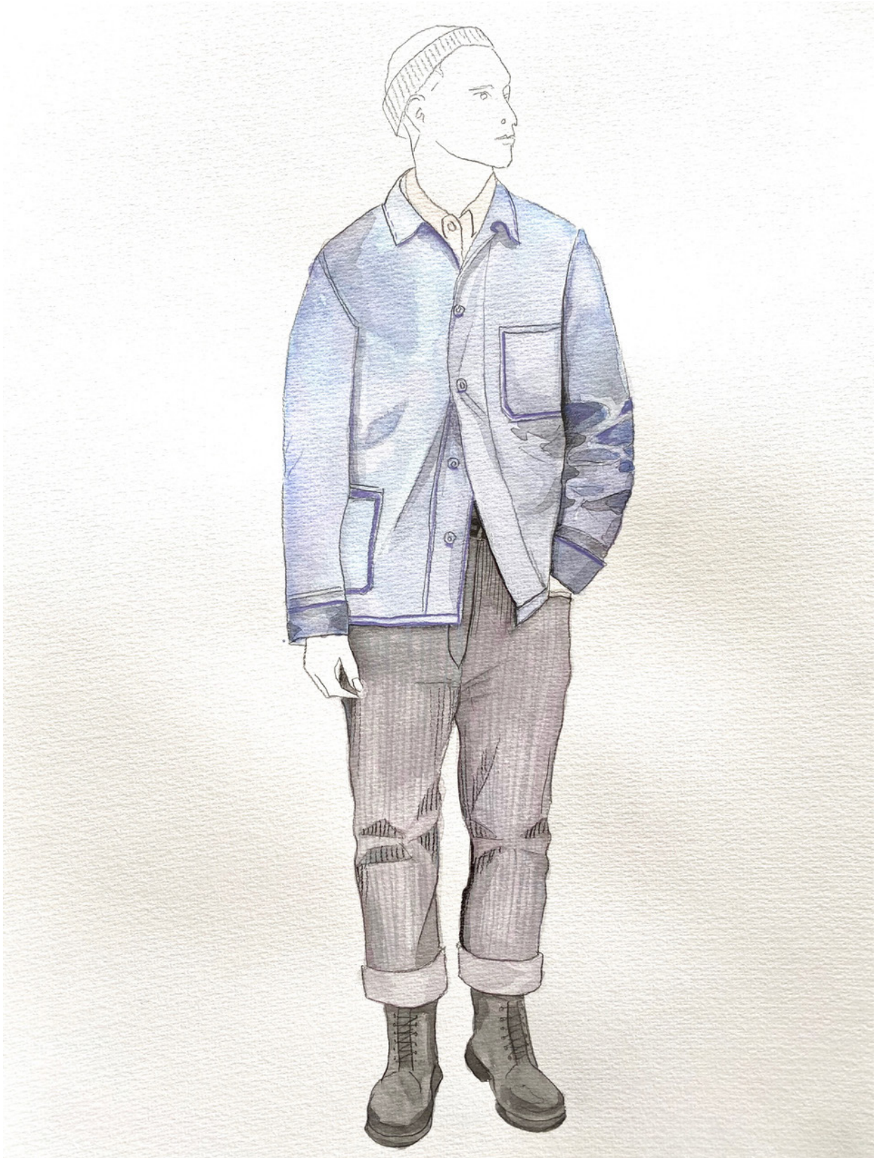
Costume design for Luigi in No Pay? No Way! . (Costume Sketch: Charles Davis 2020. ©)