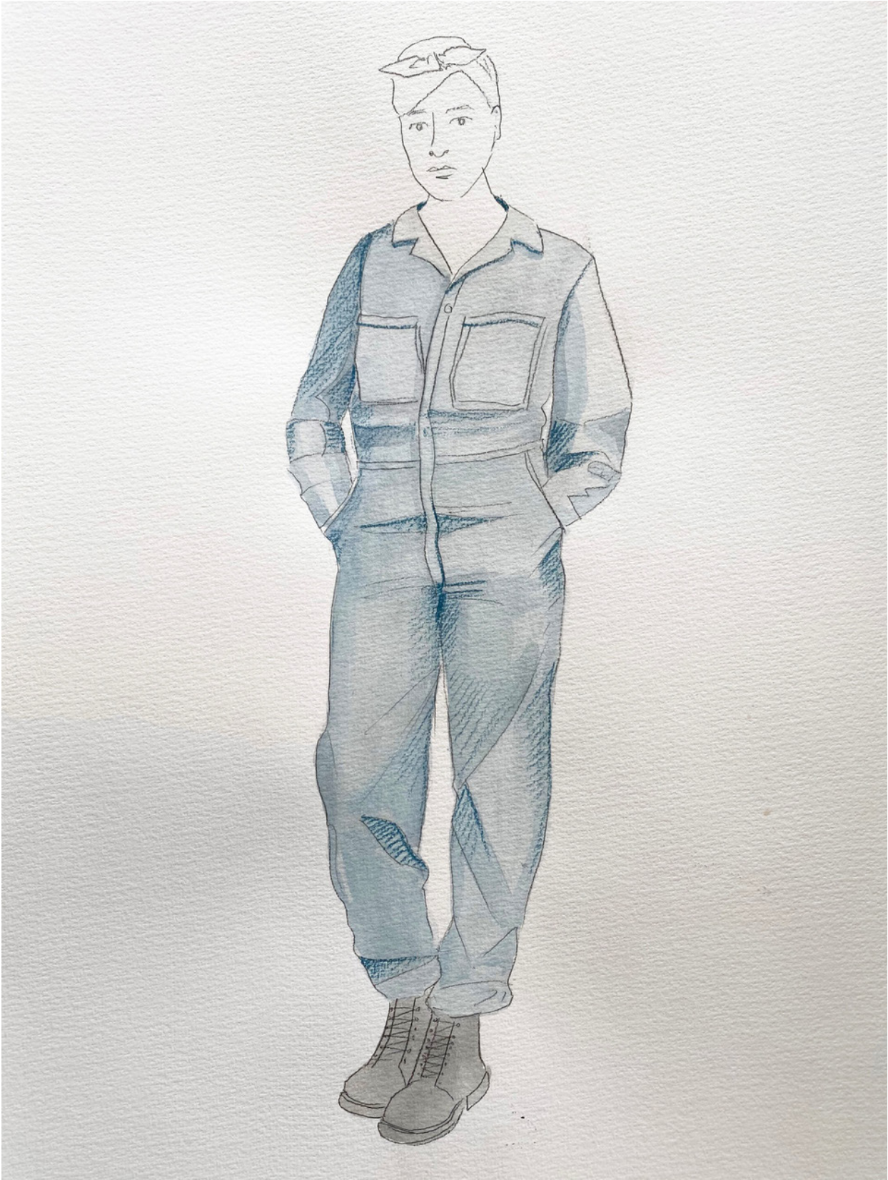
Costume design for Margherita in No Pay? No Way! . (Costume Sketch: Charles Davis 2020. ©)