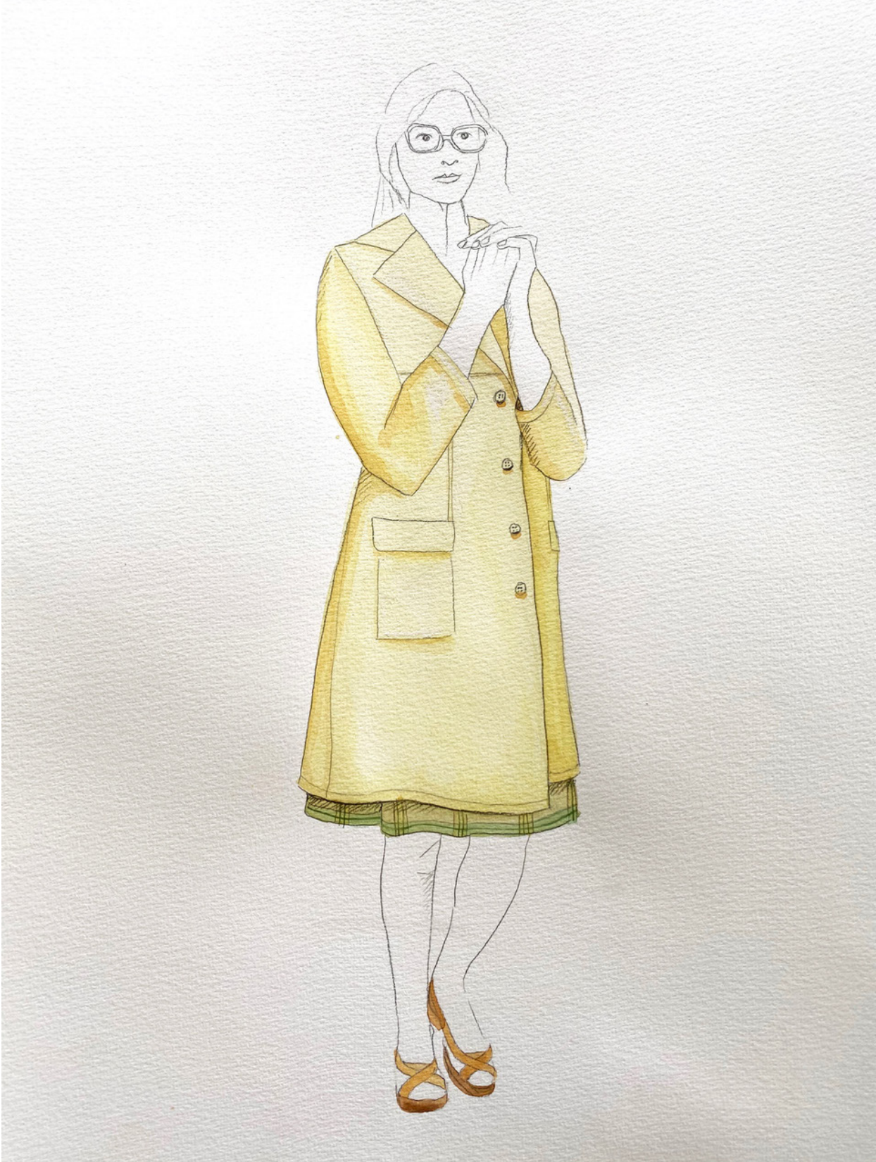
Costume design for Margherita in No Pay? No Way! . (Costume Sketch: Charles Davis 2020. ©)