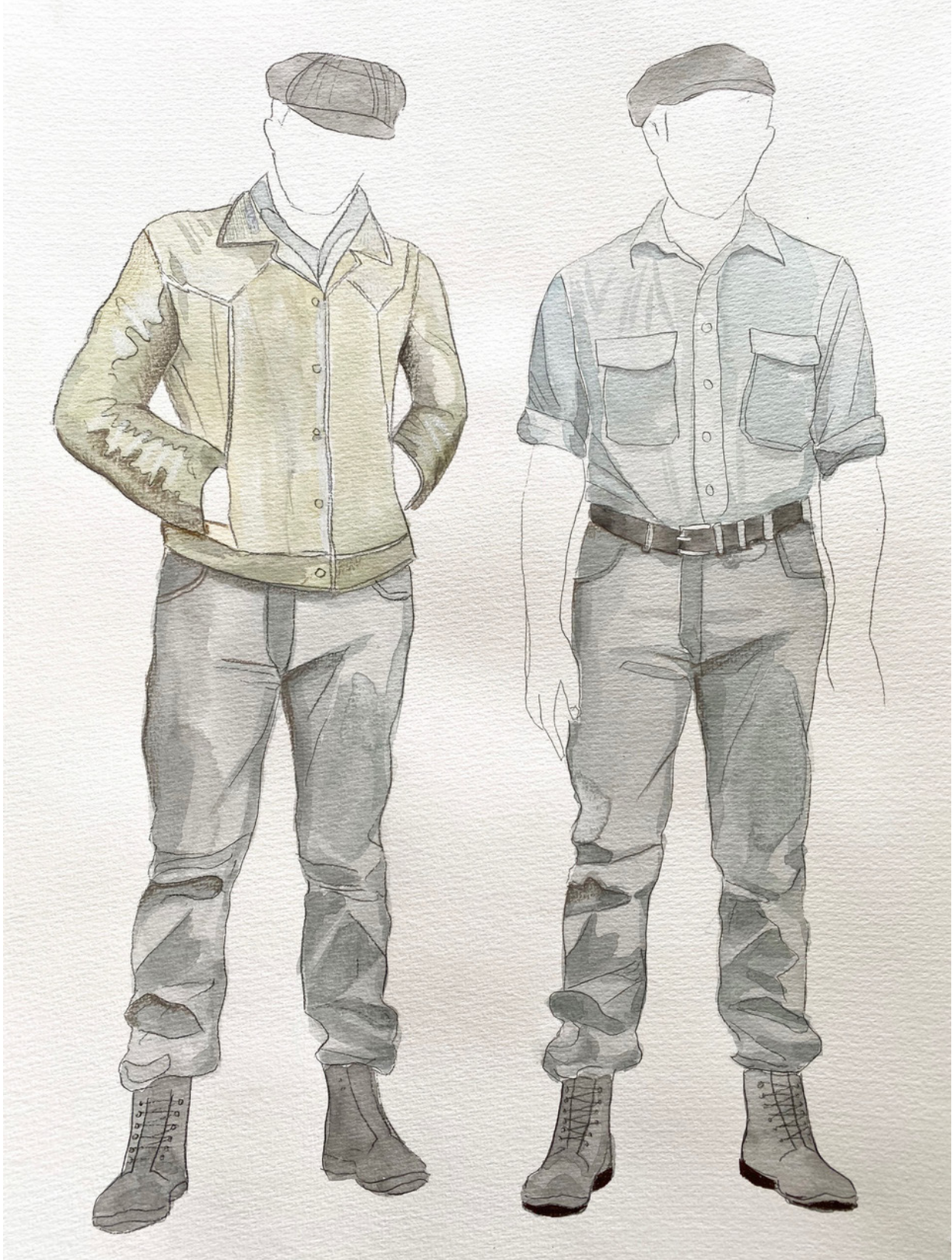
Costume design for Giovanni in No Pay? No Way! . (Costume Sketch: Charles Davis 2020. ©)