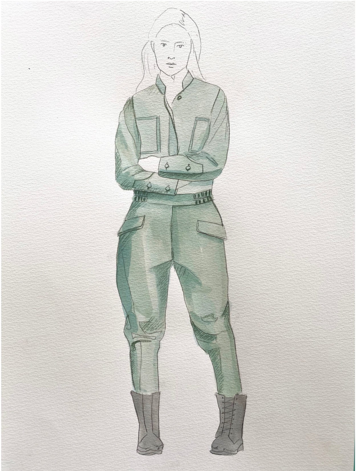
Costume design for Antonia in No Pay? No Way! . (Costume Sketch: Charles Davis 2020. ©)