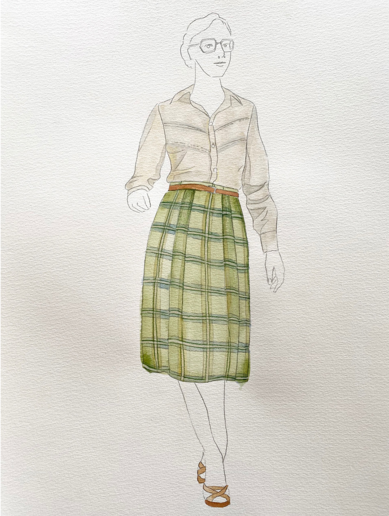
Costume design for Margherita in No Pay? No Way! . (Costume Sketch: Charles Davis 2020. ©)