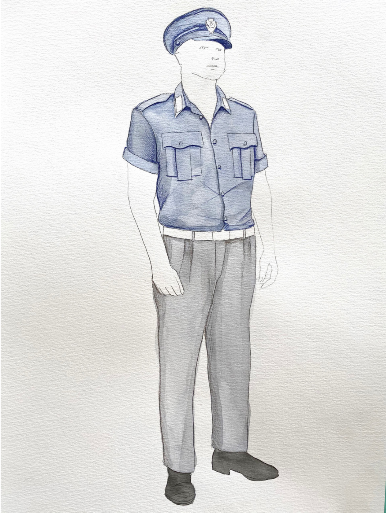
Costume design for Sergeant in No Pay? No Way! . (Costume Sketch: Charles Davis 2020. ©)