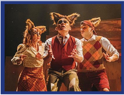
FANTASTIC MR. FOX