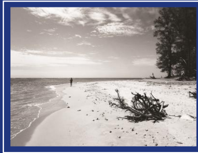
ON THE BEACH