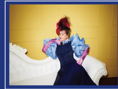
THE IMPORTANCE OF BEING EARNEST