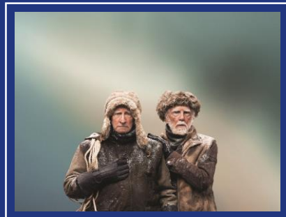
DO NOT GO GENTLE