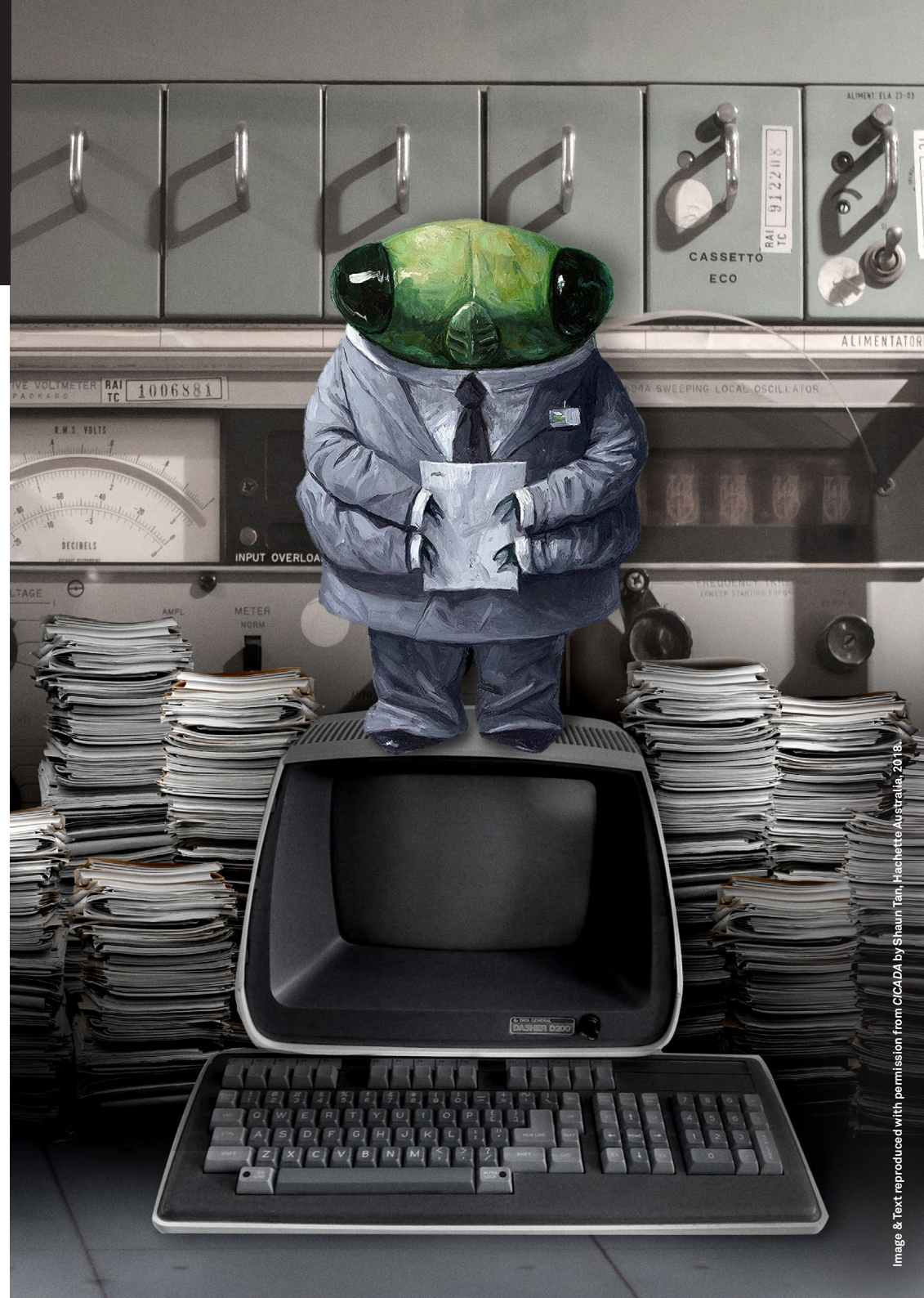
Image & Text reproduced with permission from CICADA by Shaun Tan, Hachette Australia, 2018.

CONTENT Haze effects and flashing lights Suitable for ages 8+