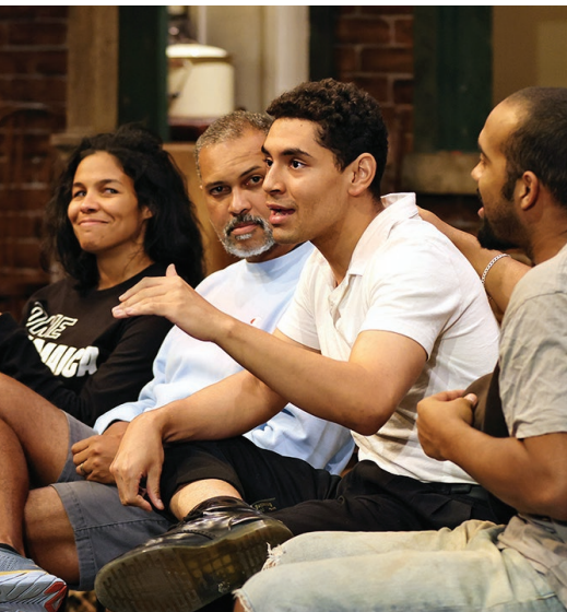
Fences Night with the Artists.

Look out for our Community events where we invite people to engage more deeply with the production through activations such as yarnning circles, spoken word events, live music and more. These are fun and free events.